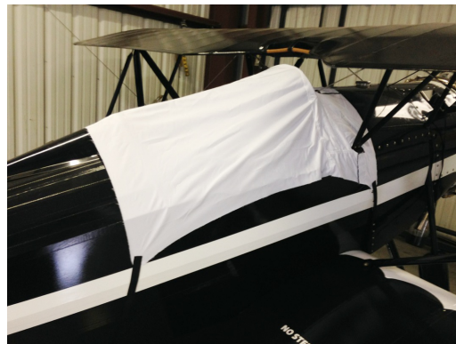
Rose Parakeet Canopy Cover (test fit cover)