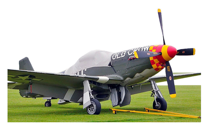
Canopy Cover, Chin Scoop & Exhaust Plugs