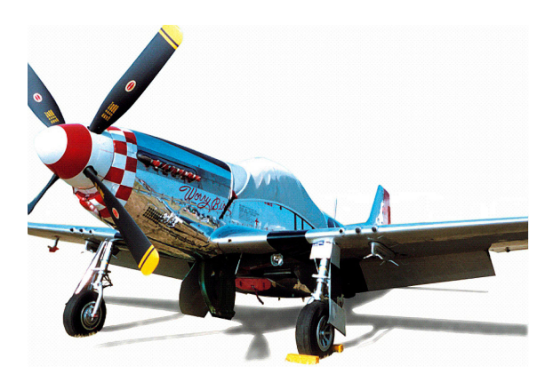
Canopy Cover, Belly & Chin Scoop Plugs