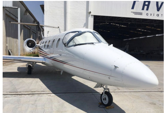
Beechjet Cockpit Heatshields