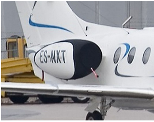
Nextant 400XTi Bikini Type Engine Covers