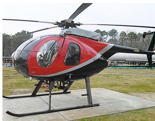
Customized Engine Cover