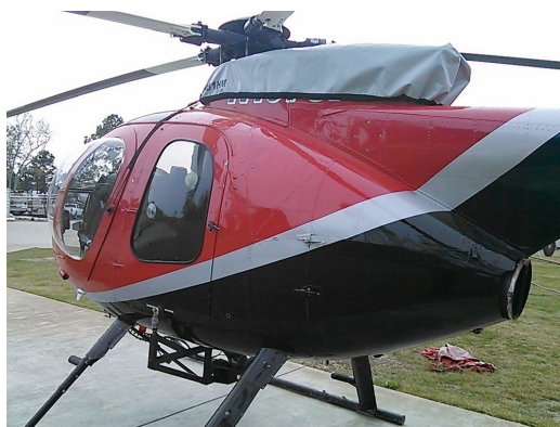
Customized Engine Cover