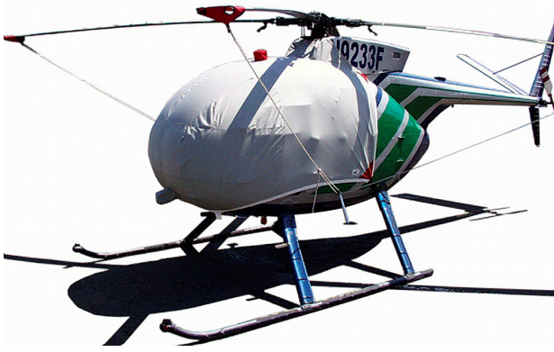
Hughes 500C Bubble Cover with Intake Add-on, Blade Tie-downs