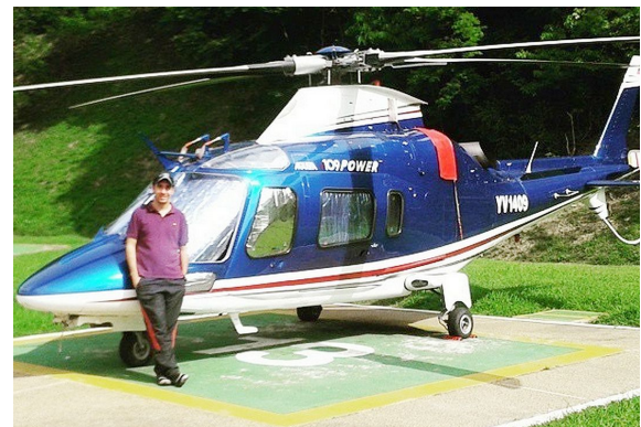
Agusta Power Cockpit & Cabin HeatShields