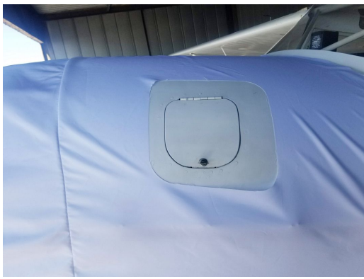
Kitfox Engine Cover, "Radial Cowl" type, test fit