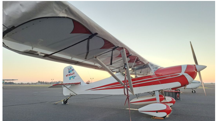
Kitfox Wing Covers