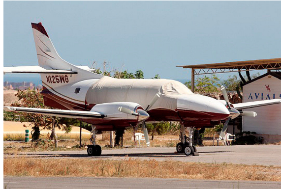
Merlin Canopy Cover

Travel Covers are made with Silver Solution-Dyed Polyester fabric and only lined over the windshield to save weight. The material is lightweight and more compact for easy stowage in the aircraft. The polyester material is water resistant, but only intended for occasional use outside. We also have an ultra lightweight material available for fitted hangar dust covers. For daily outdoor use, the non-travel Sunbrella Cover is the best choice.