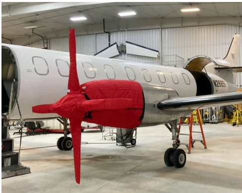
Fairchild Merlin Insulated Engine & Prop Covers

This cover type is made from Silver Acrylic Sunbrella canvas and is 100% lined with a soft and smooth microfiber. Bruce's Custom Covers developed this material combination especially for aircraft protection. The outer material is medium weight and treated for water resistance, UV resistance and anti-static buildup. The inner lining is a very soft and smooth microfiber to prevent scratching. The material is very reflective, and tests show that the cabin interior temperature can be reduced to near-ambient temperature on the hottest of days. It is water, ice and snow repellent, yet breathable to allow moisture to escape from between the cover and the aircraft surface.