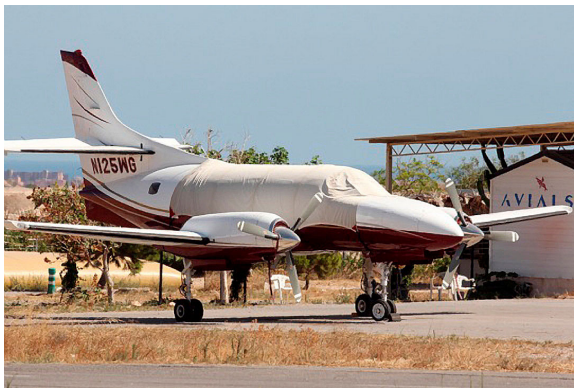
Merlin Canopy Cover

This cover type is made from Silver Acrylic Sunbrella canvas and is 100% lined with a soft and smooth microfiber. Bruce's Custom Covers developed this material combination especially for aircraft protection. The outer material is medium weight and treated for water resistance, UV resistance and anti-static buildup. The inner lining is a very soft and smooth microfiber to prevent scratching. The material is very reflective, and tests show that the cabin interior temperature can be reduced to near-ambient temperature on the hottest of days. It is water, ice and snow repellent, yet breathable to allow moisture to escape from between the cover and the aircraft surface.