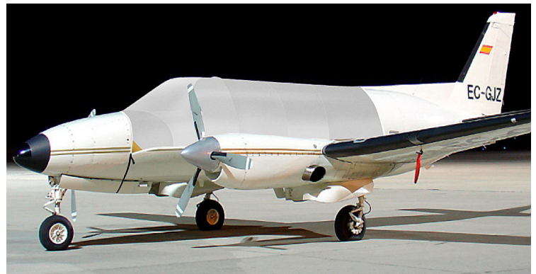
Merlin Canopy Cover (illustration)