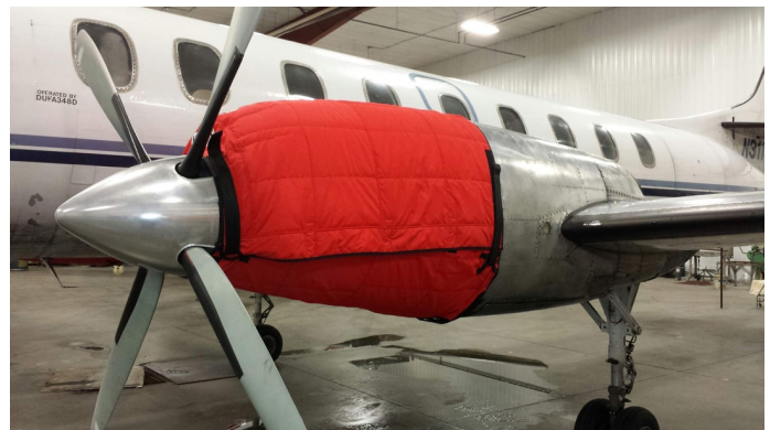
Merlin Insulated Engine Covers