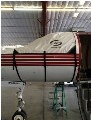
Merlin Cockpit Cover

This cover type is made from Silver Acrylic Sunbrella canvas and is 100% lined with a soft and smooth microfiber. Bruce's Custom Covers developed this material combination especially for aircraft protection. The outer material is medium weight and treated for water resistance, UV resistance and anti-static buildup. The inner lining is a very soft and smooth microfiber to prevent scratching. The material is very reflective, and tests show that the cabin interior temperature can be reduced to near-ambient temperature on the hottest of days. It is water, ice and snow repellent, yet breathable to allow moisture to escape from between the cover and the aircraft surface.