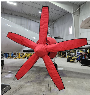
Fairchild Metro 5 Blade Insulated Prop Covers

This cover type is made from Silver Acrylic Sunbrella canvas and is 100% lined with a soft and smooth microfiber. Bruce's Custom Covers developed this material combination especially for aircraft protection. The outer material is medium weight and treated for water resistance, UV resistance and anti-static buildup. The inner lining is a very soft and smooth microfiber to prevent scratching. The material is very reflective, and tests show that the cabin interior temperature can be reduced to near-ambient temperature on the hottest of days. It is water, ice and snow repellent, yet breathable to allow moisture to escape from between the cover and the aircraft surface.