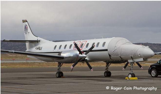
Merlin Cockpit/Nose Cover