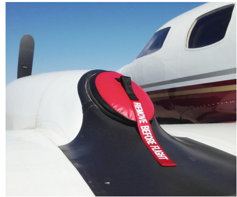
Merlin Exhaust Plug