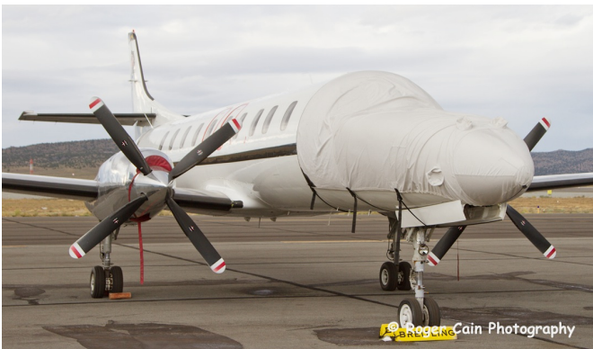
Merlin Cockpit/Nose Cover