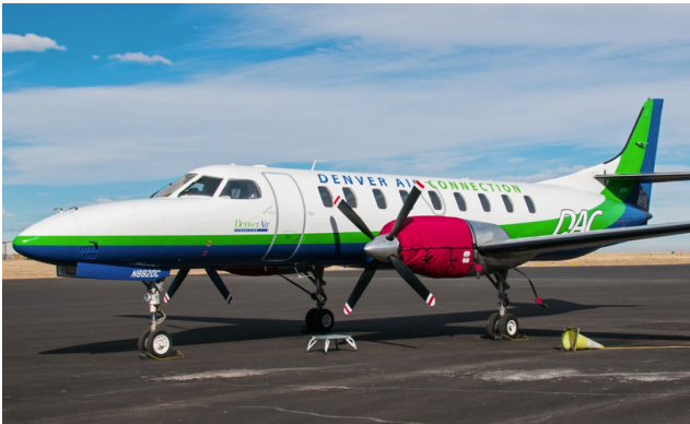
Merlin Insulated Engine Covers

This cover type is made from Silver Acrylic Sunbrella canvas and is 100% lined with a soft and smooth microfiber. Bruce's Custom Covers developed this material combination especially for aircraft protection. The outer material is medium weight and treated for water resistance, UV resistance and anti-static buildup. The inner lining is a very soft and smooth microfiber to prevent scratching. The material is very reflective, and tests show that the cabin interior temperature can be reduced to near-ambient temperature on the hottest of days. It is water, ice and snow repellent, yet breathable to allow moisture to escape from between the cover and the aircraft surface.