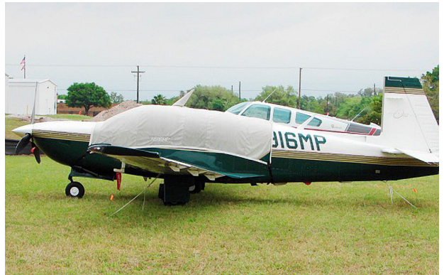
Mooney Ovation Canopy Cover