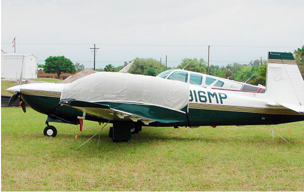
Mooney Ovation Canopy Cover

Travel Covers are made with Silver Solution-Dyed Polyester fabric and only lined over the windshield to save weight. The material is lightweight and more compact for easy stowage in the aircraft. The polyester material is water resistant, but only intended for occasional use outside. We also have an ultra lightweight material available for fitted hangar dust covers. For daily outdoor use, the non-travel Sunbrella Cover is the best choice.