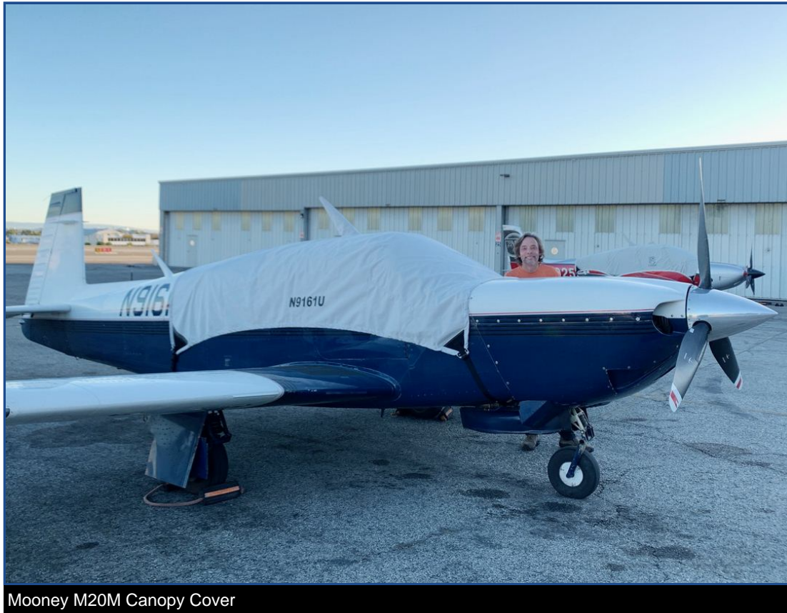
Mooney M20M Canopy Cover