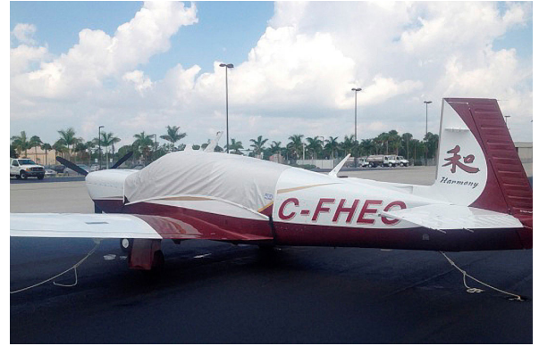
Mooney TLS Canopy Cover