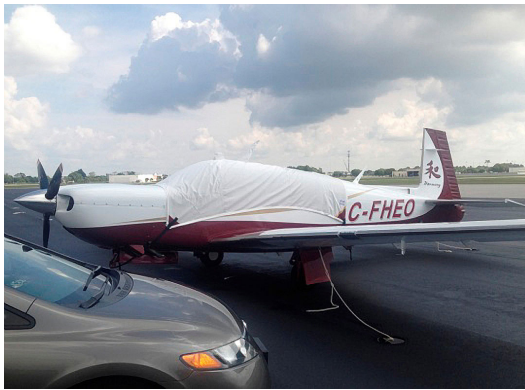
Mooney TLS Canopy Cover

This cover type is made from Silver Acrylic Sunbrella canvas and is 100% lined with a soft and smooth microfiber. Bruce's Custom Covers developed this material combination especially for aircraft protection. The outer material is medium weight and treated for water resistance, UV resistance and anti-static buildup. The inner lining is a very soft and smooth microfiber to prevent scratching. The material is very reflective, and tests show that the cabin interior temperature can be reduced to near-ambient temperature on the hottest of days. It is water, ice and snow repellent, yet breathable to allow moisture to escape from between the cover and the aircraft surface.