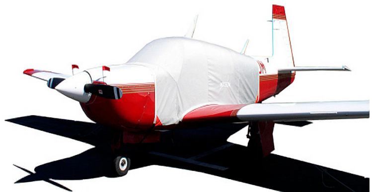
Mooney Extended Canopy Cover & Engine Plugs