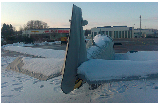
Mooney 231 Full Cover Set...Brrrrrrrr

WINTER USE MATERIAL - Made with Solution-Dyed Polyester fabric, this option is intended for seasonal use to aid in deicing, rain mitigation, or for occasional travel. The material is lighter and more compact, but more susceptible to UV damage and may have a shorter useful life if used continuously outside than the all-year use material.