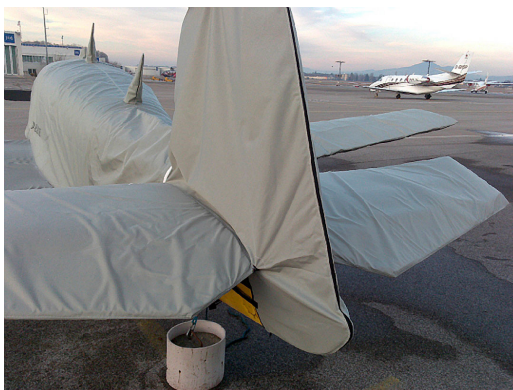
Mooney 231 Full Cover Set: Extra Extended Canopy/Engine Cover, Wing Covers, and Empennage Cover

WINTER USE MATERIAL - Made with Solution-Dyed Polyester fabric, this option is intended for seasonal use to aid in deicing, rain mitigation, or for occasional travel. The material is lighter and more compact, but more susceptible to UV damage and may have a shorter useful life if used continuously outside than the all-year use material.