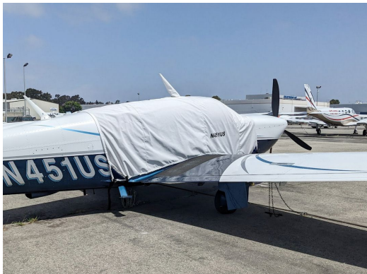
Mooney Ovation Extended Canopy Cover

This cover type is made from Silver Acrylic Sunbrella canvas and is 100% lined with a soft and smooth microfiber. Bruce's Custom Covers developed this material combination especially for aircraft protection. The outer material is medium weight and treated for water resistance, UV resistance and anti-static buildup. The inner lining is a very soft and smooth microfiber to prevent scratching. The material is very reflective, and tests show that the cabin interior temperature can be reduced to near-ambient temperature on the hottest of days. It is water, ice and snow repellent, yet breathable to allow moisture to escape from between the cover and the aircraft surface.