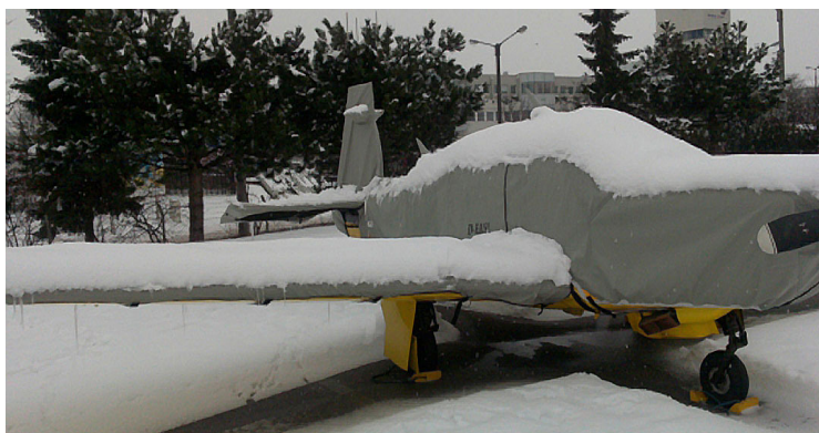
Mooney 231 Full Cover Set, doing its job in the Austrian Winter