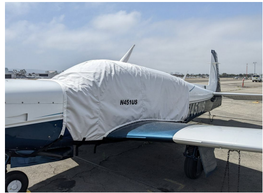
Mooney Ovation Extended Canopy Cover