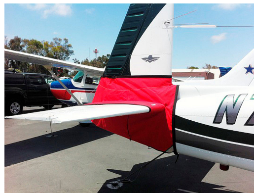
Mooney Tailcone Cover, completely enclosed