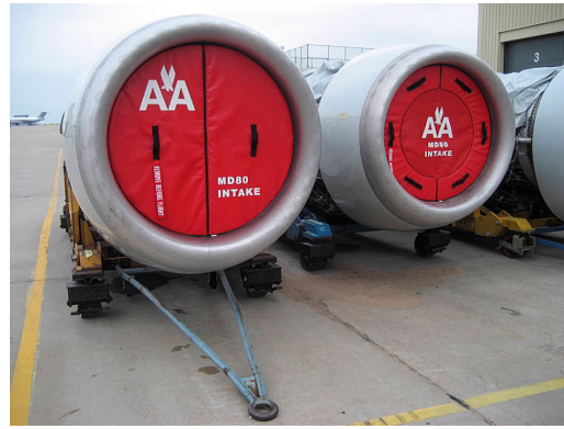
MD-80 JT8D Intake Plugs, Solid Foam folding type& Mesh Center folding type