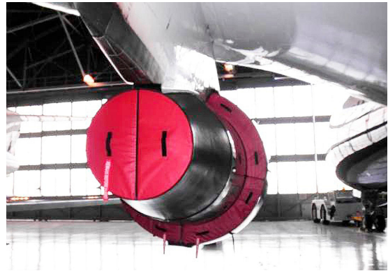
Exhaust Plugs Ship Set, incl. Fan Thrust Reverser and Exhaust Plugs P/N: B767-200