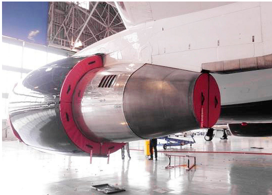
DC-10 Bypass Vent, Exhaust Plug set Exhaust Plugs Ship Set, incl. Fan Thrust Reverser and Exhaust Plugs P/N: B767-200