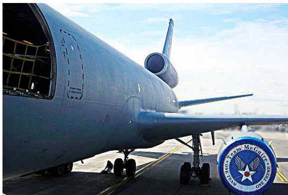
KC-10 Intake Cover at McGuire AFB, NJ