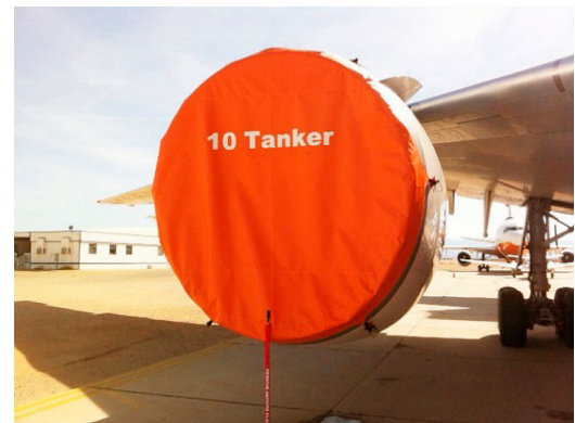
DC-10 Intake Cover