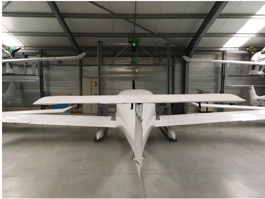
Dynaero MCR Horizontal Stabilizer Cover