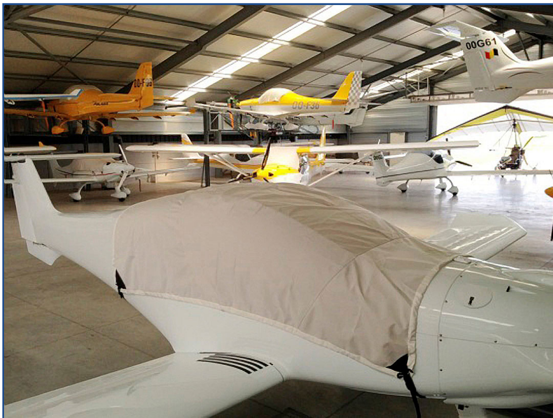
Dynaero MCR Pickup Canopy Cover