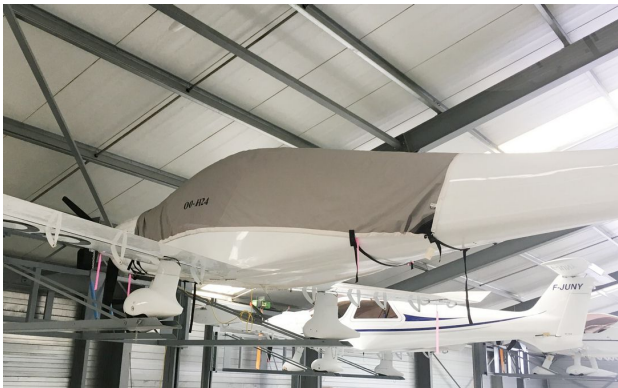
Dynaero MCR.4 Pickup Canopy Cover

This cover type is made from Silver Acrylic Sunbrella canvas and is 100% lined with a soft and smooth microfiber. Bruce's Custom Covers developed this material combination especially for aircraft protection. The outer material is medium weight and treated for water resistance, UV resistance and anti-static buildup. The inner lining is a very soft and smooth microfiber to prevent scratching. The material is very reflective, and tests show that the cabin interior temperature can be reduced to near-ambient temperature on the hottest of days. It is water, ice and snow repellent, yet breathable to allow moisture to escape from between the cover and the aircraft surface.