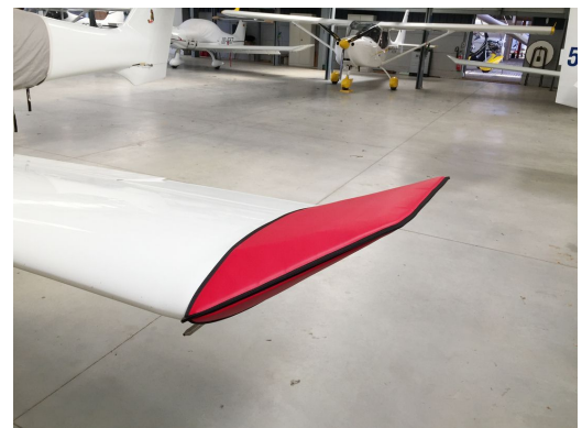
Dynaero MCR Pickup Wingtip Pads