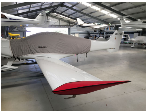
Dynaero MCR.4 Pickup Canopy Cover, Wingtip Pads

Designed to prevent damage to the aircraft extremities in crowded hangars, these products are made of bright red Naugahyde and thickly padded with a sandwich of closed cell foam.