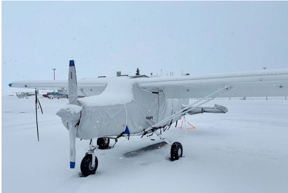
Maule MX7-180 Extended Canopy Cover, Engine, Prop & Empennage Covers.

This cover type is made from Silver Acrylic Sunbrella canvas and is 100% lined with a soft and smooth microfiber. Bruce's Custom Covers developed this material combination especially for aircraft protection. The outer material is medium weight and treated for water resistance, UV resistance and anti-static buildup. The inner lining is a very soft and smooth microfiber to prevent scratching. The material is very reflective, and tests show that the cabin interior temperature can be reduced to near-ambient temperature on the hottest of days. It is water, ice and snow repellent, yet breathable to allow moisture to escape from between the cover and the aircraft surface.