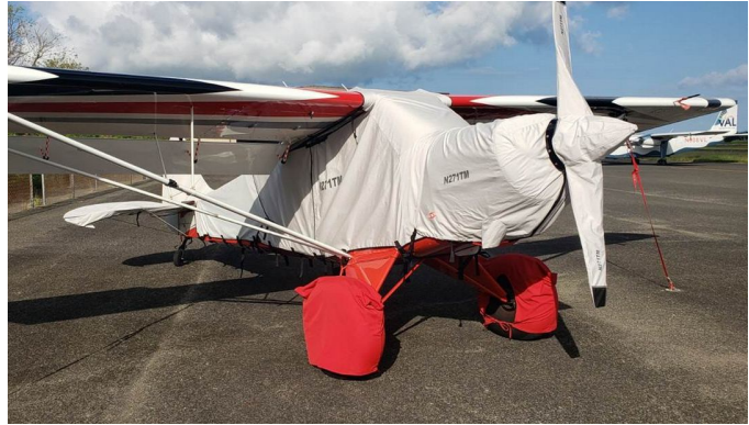
Aviat Husky Extended Canopy Cover, Engine, Prop, Empennage & Tire Covers