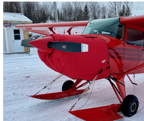
Maule M5 Insulated Engine Cover