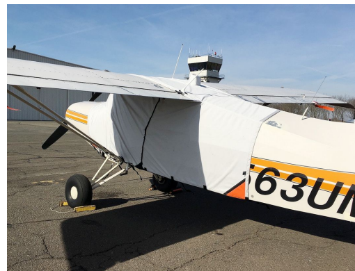
Maule (All Models) Extended Canopy Cover (Over-Top Style), Specify Model & Year Maule M-5-235C Extended Canopy Cover