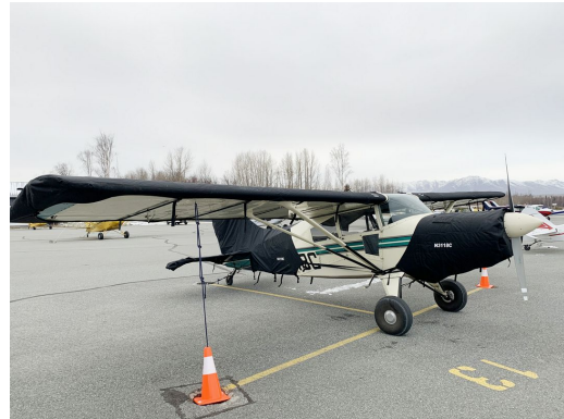
Maule Insulated Engine Cover, Wing & Empennage Covers