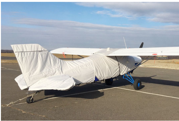
Maule M-5-235C Extended Canopy Cover, Empennage Cover