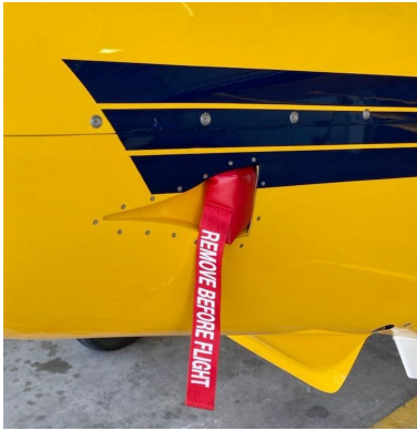
Maule MX-7-180C NACA vent plugs

have warning flags that are visible from the cockpit or 'remove before flight' streamers sewn onto the face of the plugs. Most plugs are imprinted with the aircraft registration number in black for an extra charge. Storage bag NOT included. Engine plugs may be inserted after flight when the engine is still warm. Engine Inlet Plugs are commonly referred to as Cowl Plugs, Intake Plugs, Cowl Blocks, Engine Blocks, and Engine Bungs.