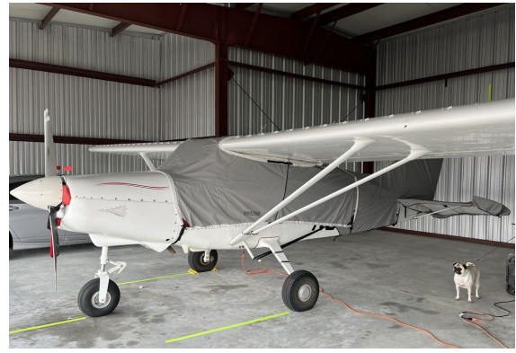
Maule MXT-7-180 Canopy & Empennage Covers, travel weight