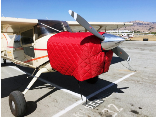
FOR INTERIOR USE. Maule Insulated Hangar Blanket, available in Red or Silver

This cover type is made from Silver Acrylic Sunbrella canvas and is 100% lined with a soft and smooth microfiber. Bruce's Custom Covers developed this material combination especially for aircraft protection. The outer material is medium weight and treated for water resistance, UV resistance and anti-static buildup. The inner lining is a very soft and smooth microfiber to prevent scratching. The material is very reflective, and tests show that the cabin interior temperature can be reduced to near-ambient temperature on the hottest of days. It is water, ice and snow repellent, yet breathable to allow moisture to escape from between the cover and the aircraft surface.