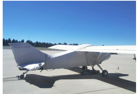
Maule MX7-180 Prop, Engine, Extended Canopy & Empennage Covers Maule M7-180 Full Body Over-Top Fuselage/Tail Cover