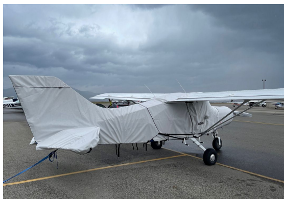
Maule MX7-180 Prop, Engine, Extended Canopy & Empennage Covers