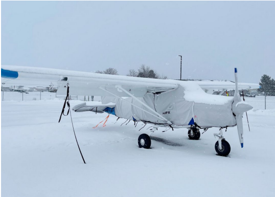
Maule MX7-180 Extended Canopy Cover, Engine, Prop & Empennage Covers.