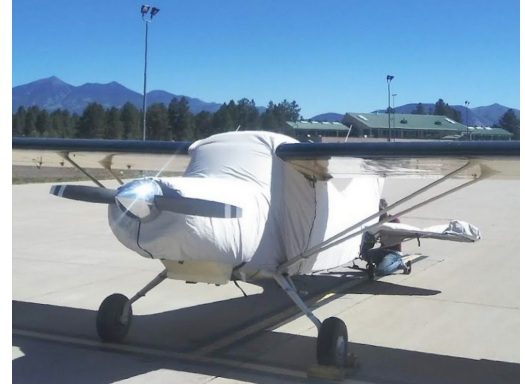
Maule M7-180 Full Body Over-Top Fuselage/Tail Cover