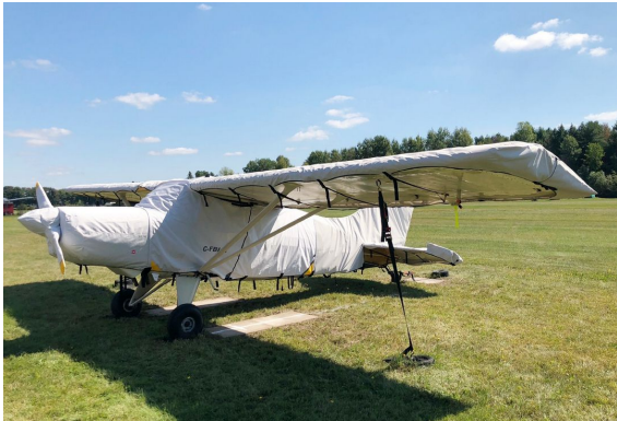
Maule Complete Cover Set

WINTER USE MATERIAL - Made with Solution-Dyed Polyester fabric, this option is intended for seasonal use to aid in deicing, rain mitigation, or for occasional travel. The material is lighter and more compact, but more susceptible to UV damage and may have a shorter useful life if used continuously outside than the all-year use material.