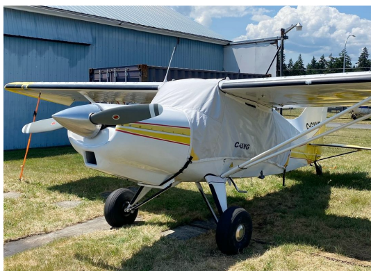
Maule M5-235C Canopy Cover, wrap around type