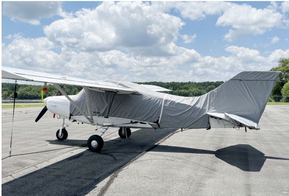
Maule M7-180 Insulated Engine & Prop Covers, Wing Covers Maule MXT-7-180 Canopy & Empennage Covers, travel weight