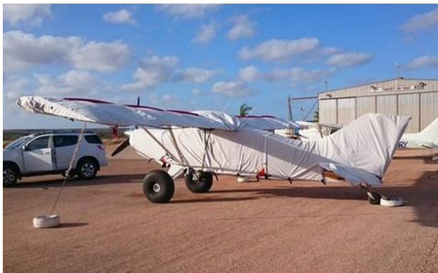
Maule M7-235 Extended Canopy, Wing, Engine & Empennage Covers

This cover type is made from Silver Acrylic Sunbrella canvas and is 100% lined with a soft and smooth microfiber. Bruce's Custom Covers developed this material combination especially for aircraft protection. The outer material is medium weight and treated for water resistance, UV resistance and anti-static buildup. The inner lining is a very soft and smooth microfiber to prevent scratching. The material is very reflective, and tests show that the cabin interior temperature can be reduced to near-ambient temperature on the hottest of days. It is water, ice and snow repellent, yet breathable to allow moisture to escape from between the cover and the aircraft surface.