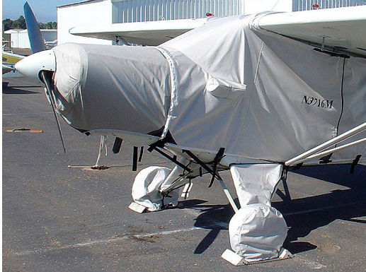
Piper PA-12 Landing Gear Covers

ALL-YEAR USE MATERIAL - Made with Silver Acrylic Sunbrella canvas, the all-year use material is the best option for sun protection and cover longevity. This heavier more durable material is intended for all weather conditions, such as rain and snow or lots of sun.