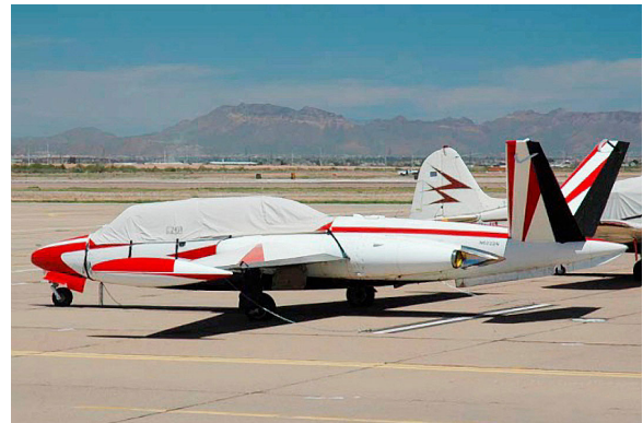
Fouga Magister Canopy Cover