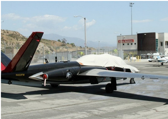
Fouga Magister Canopy/Nose Cover with nose mount loop antenna