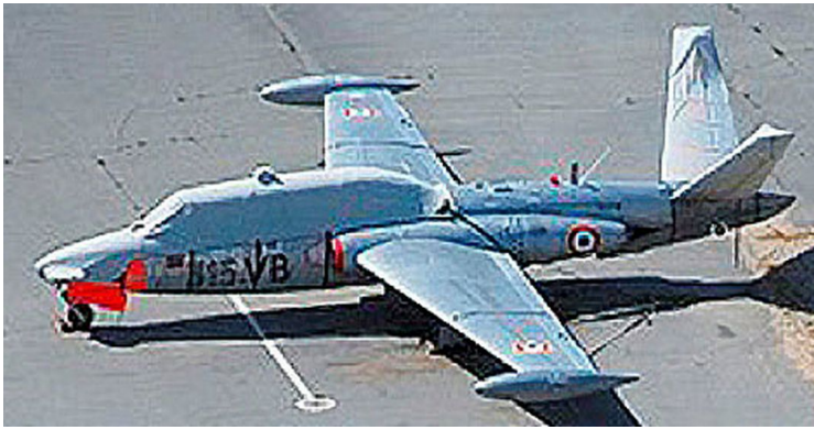
Fouga Magister Canopy/Nose & Stabilizer Covers