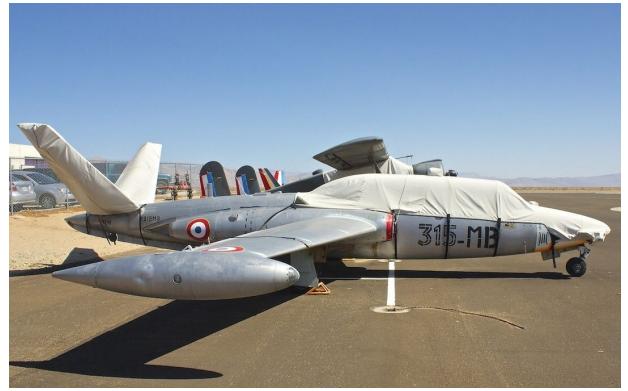
Fouga Magister Canopy/Nose Cover, Tail Stabilizer Covers