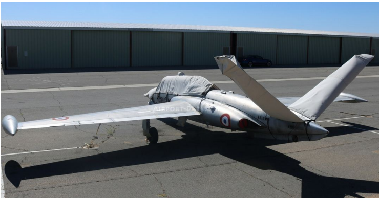
Fouga Magister Canopy/Nose Cover, Tail Stabilizer Covers

This cover type is made from Silver Acrylic Sunbrella canvas and is 100% lined with a soft and smooth microfiber. Bruce's Custom Covers developed this material combination especially for aircraft protection. The outer material is medium weight and treated for water resistance, UV resistance and anti-static buildup. The inner lining is a very soft and smooth microfiber to prevent scratching. The material is very reflective, and tests show that the cabin interior temperature can be reduced to near-ambient temperature on the hottest of days. It is water, ice and snow repellent, yet breathable to allow moisture to escape from between the cover and the aircraft surface.