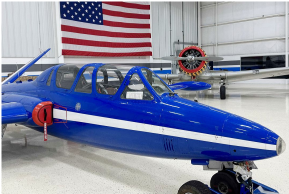
Fouga Magister CM170 Intake Plugs