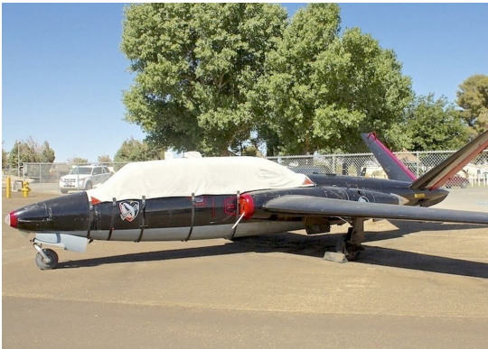
Fouga Magister Canopy Cover, Engine Plugs