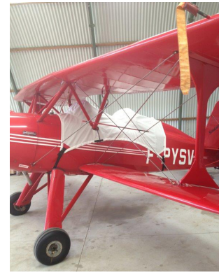
Starduster Too Canopy Cover