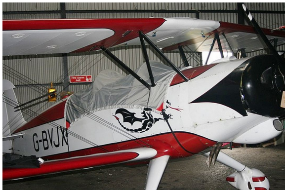
Marquardt Charger MA-5 Light Weight Travel Cockpit Cover

This cover type is made from Silver Acrylic Sunbrella canvas and is 100% lined with a soft and smooth microfiber. Bruce's Custom Covers developed this material combination especially for aircraft protection. The outer material is medium weight and treated for water resistance, UV resistance and anti-static buildup. The inner lining is a very soft and smooth microfiber to prevent scratching. The material is very reflective, and tests show that the cabin interior temperature can be reduced to near-ambient temperature on the hottest of days. It is water, ice and snow repellent, yet breathable to allow moisture to escape from between the cover and the aircraft surface.