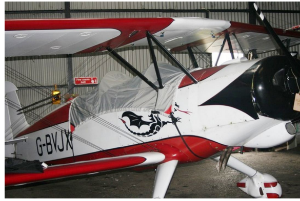
Marquardt Charger MA-5 Canopy Cover