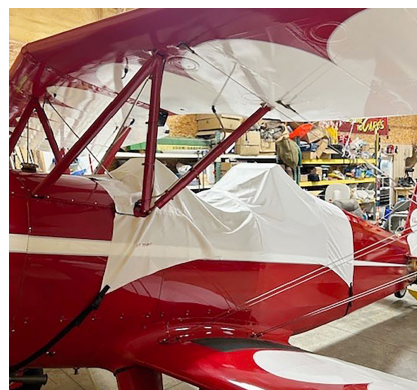
Marquardt Charger MA-5 Cockpit Cover