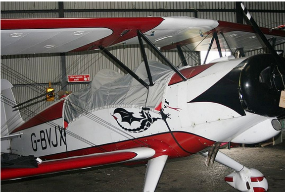
Marquardt Charger MA-5 Light Weight Travel Cockpit Cover