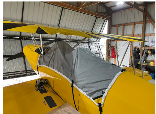
Marquardt Charger Travel Weight Canopy Cover