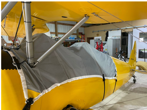
Marquardt Charger Travel Weight Canopy Cover

This cover type is made from Silver Acrylic Sunbrella canvas and is 100% lined with a soft and smooth microfiber. Bruce's Custom Covers developed this material combination especially for aircraft protection. The outer material is medium weight and treated for water resistance, UV resistance and anti-static buildup. The inner lining is a very soft and smooth microfiber to prevent scratching. The material is very reflective, and tests show that the cabin interior temperature can be reduced to near-ambient temperature on the hottest of days. It is water, ice and snow repellent, yet breathable to allow moisture to escape from between the cover and the aircraft surface.