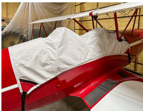
Marquardt Charger MA-5 Cockpit Cover