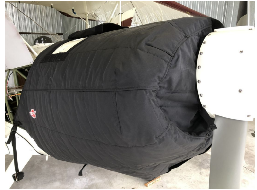
Marquardt Charger MA-5 Insulated Engine Cover