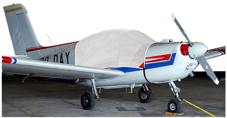
Standard Canopy Cover for MS893A