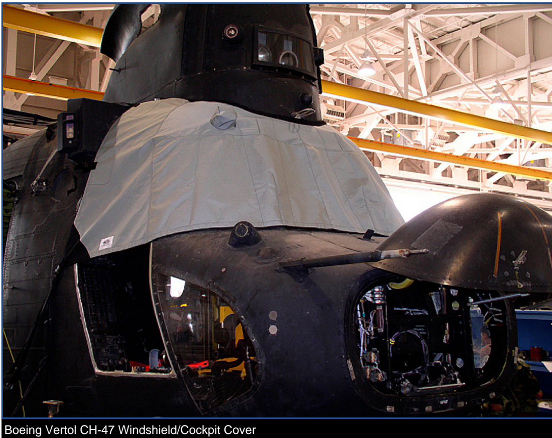
Boeing Vertol CH-47 Windshield/Cockpit Cover