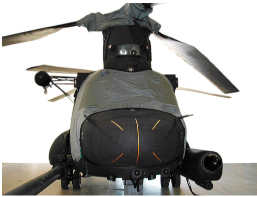
Boeing Vertol CH-47 Forward Cabin & Rotor Hub Cover