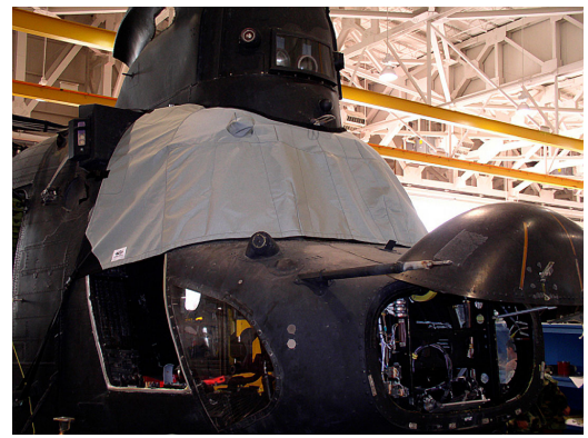
Boeing Vertol CH-47 Windshield/Cockpit Cover