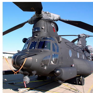
Boeing Vertol MH-47 Rotor Hubs, Engine & Other Covers