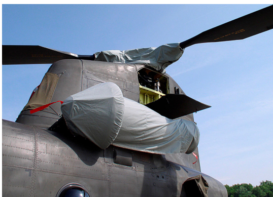
Boeing Vertol CH-47 Engine and Rotor Hub Covers

Insulated Covers Material - A special composite material of solution-dyed polyester, 3M Thinsulate insulation, and soft nylon interior fabric. Our insulated covers are designed to complement an engine preheater and help retain heat in the engine compartment after shutdown. If you operate your aircraft in cold-weather, these covers will help prevent engine wear and tear.