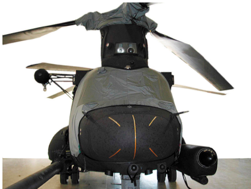
Boeing Vertol CH-47 Forward Cabin & Rotor Hub Cover

Insulated Covers Material - A special composite material of solution-dyed polyester, 3M Thinsulate insulation, and soft nylon interior fabric. Our insulated covers are designed to complement an engine preheater and help retain heat in the engine compartment after shutdown. If you operate your aircraft in cold-weather, these covers will help prevent engine wear and tear.