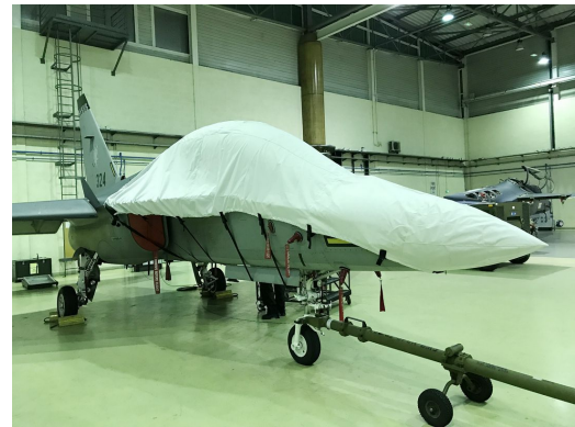
Alenia Aermacchi M-346 Canopy/Nose Cover