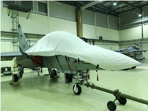
Alenia Aermacchi M-346 Canopy/Nose Cover