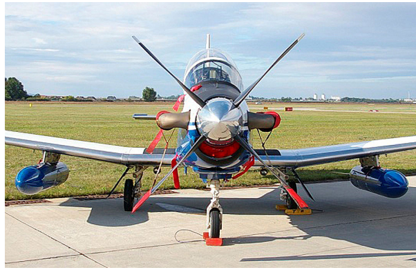
Texan II T6A Engine Inlet Plug, Prop Tie/Exhaust Covers