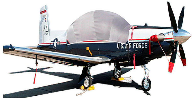
Pilatus PC-9 Canopy Cover, Prop Tie-Down, Engine Plug, Pitot Cover