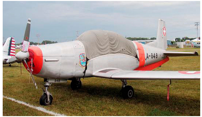
Pilatus P-3 Canopy Cover