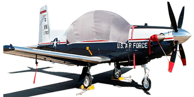
Pilatus PC-9 Canopy Cover, Prop Tie-Down, Engine Plug, Pitot Cover