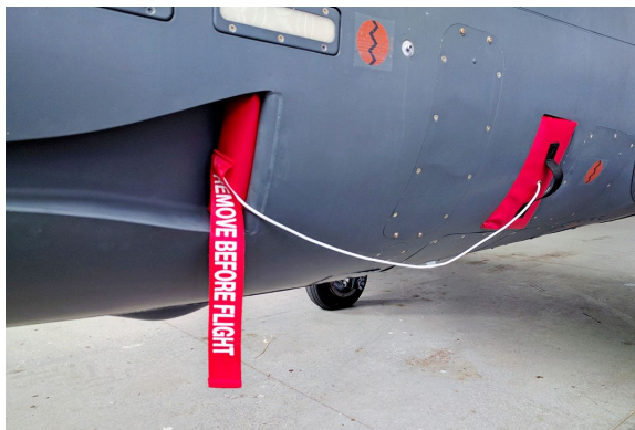
Embraer EMB 312 Tucano Side Naca Plugs

Engine Inlet Plugs are custom fit for your Embraer EMB 312 Tucano, T-27 intakes, made with heavy-duty vinyl material, and stuffed with a single block of sculpted urethane foam. Each plug has a zipper that allows the foam to be removed and dried if necessary. Engine plugs have warning flags that are visible from the cockpit or 'remove before flight' streamers sewn onto the face of the plugs. Most plugs are imprinted with the aircraft registration number in black for an extra charge. Storage bag NOT included. Engine plugs may be inserted after flight when the engine is still warm. Engine Inlet Plugs are commonly referred to as Cowl Plugs, Intake Plugs, Cowl Blocks, Engine Blocks, and Engine Bungs.