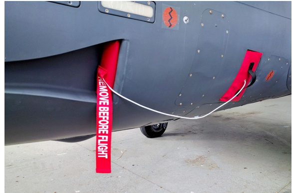
Embraer EMB 312 Tucano Side Naca Plugs