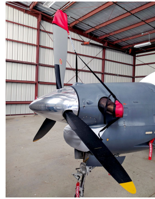
Embraer EMB 312 Tucano Prop Tie Down/Exhaust Covers