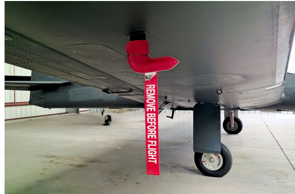
Embraer EMB 312 Tucano Pitot Covers