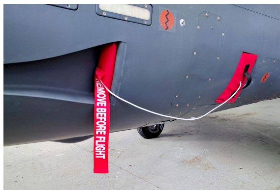
Embraer EMB 312 Tucano Side Naca Plugs