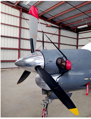
Embraer EMB 312 Tucano Prop Tie Down/Exhaust Covers