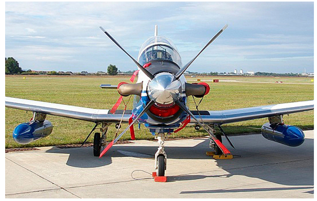
Texan II T6A Engine Inlet Plug, Prop Tie/Exhaust Covers