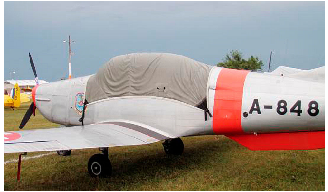
Pilatus P-3 Canopy Cover