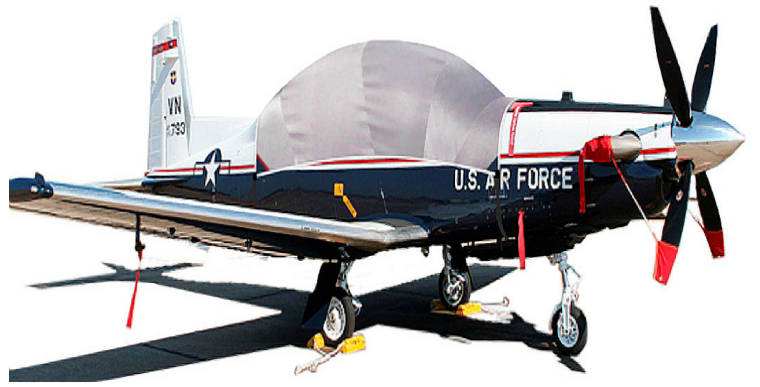
Texan II T6A Canopy Cover, Engine Inlet Plug, Prop Tie/Exhaust Covers, Pitot Cover