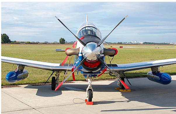
Texan II T6A Engine Inlet Plug, Prop Tie/Exhaust Covers