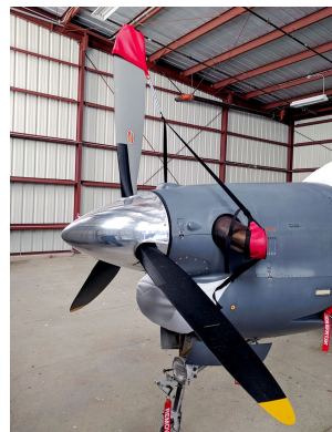
Embraer EMB 312 Tucano Prop Tie Down/Exhaust Covers