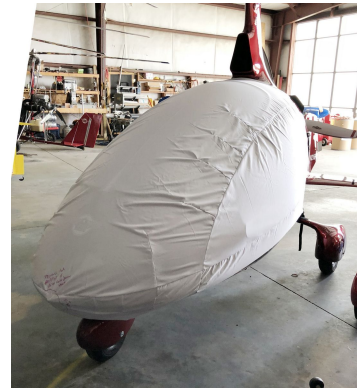
Cavalon Gyrocopter Bubble Cover, test fit cover