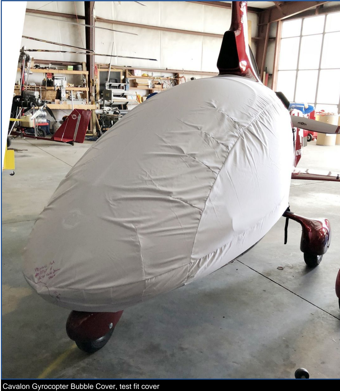
Cavalon Gyrocopter Bubble Cover, test fit cover