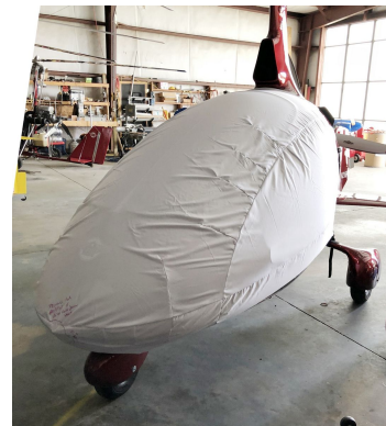
Cavalon Gyrocopter Bubble Cover, test fit cover