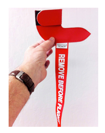
Standard Pitot Cover