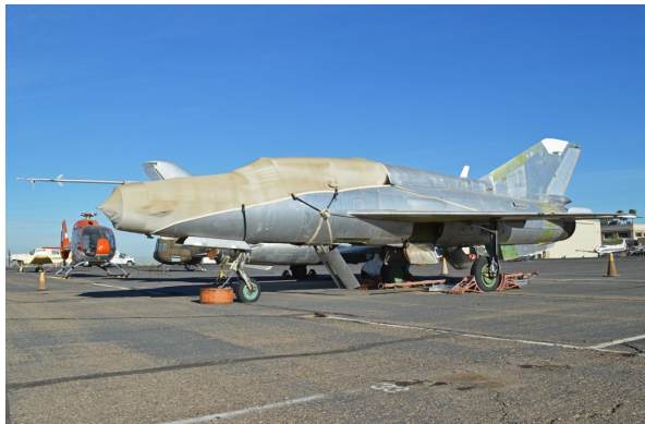
Mig 21 Canopy/Nose Cover

This cover type is made from Silver Acrylic Sunbrella canvas and is 100% lined with a soft and smooth microfiber. Bruce's Custom Covers developed this material combination especially for aircraft protection. The outer material is medium weight and treated for water resistance, UV resistance and anti-static buildup. The inner lining is a very soft and smooth microfiber to prevent scratching. The material is very reflective, and tests show that the cabin interior temperature can be reduced to near-ambient temperature on the hottest of days. It is water, ice and snow repellent, yet breathable to allow moisture to escape from between the cover and the aircraft surface.