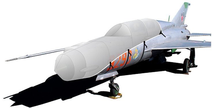
Mig 21 Canopy/Nose Cover