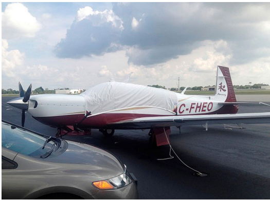
Mooney TLS Canopy Cover

This cover type is made from Silver Acrylic Sunbrella canvas and is 100% lined with a soft and smooth microfiber. Bruce's Custom Covers developed this material combination especially for aircraft protection. The outer material is medium weight and treated for water resistance, UV resistance and anti-static buildup. The inner lining is a very soft and smooth microfiber to prevent scratching. The material is very reflective, and tests show that the cabin interior temperature can be reduced to near-ambient temperature on the hottest of days. It is water, ice and snow repellent, yet breathable to allow moisture to escape from between the cover and the aircraft surface.