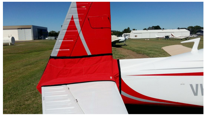
Mooney M20J Tailcone Cover