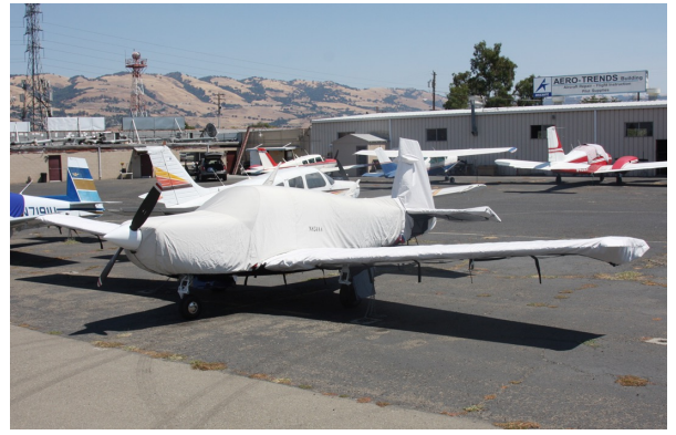
Mooney 231 Full Cover Set