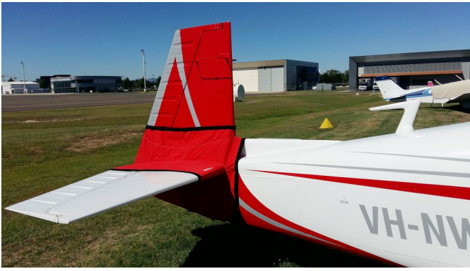
Mooney M20J Tailcone Cover