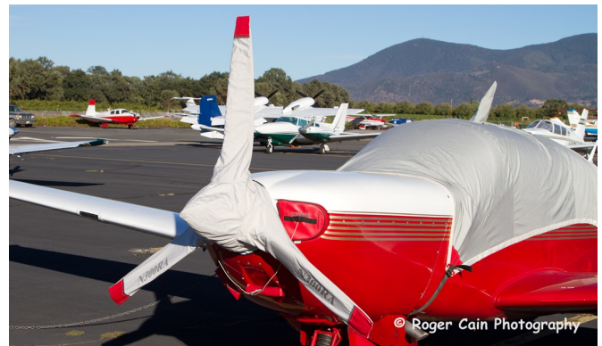
Mooney TLS/Acclaim Fully Enclosed Insulated Engine Cover, 3D model Mooney M20M Bravo 3-Blade Prop Cover, Engine Plugs