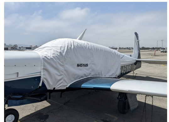
Mooney Ovation Extended Canopy Cover