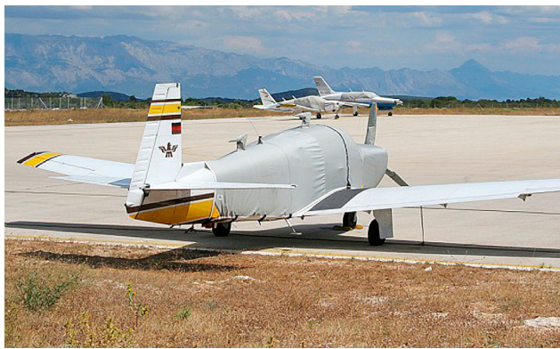
Mooney Extended Canopy/Engine Cover

This cover type is made from Silver Acrylic Sunbrella canvas and is 100% lined with a soft and smooth microfiber. Bruce's Custom Covers developed this material combination especially for aircraft protection. The outer material is medium weight and treated for water resistance, UV resistance and anti-static buildup. The inner lining is a very soft and smooth microfiber to prevent scratching. The material is very reflective, and tests show that the cabin interior temperature can be reduced to near-ambient temperature on the hottest of days. It is water, ice and snow repellent, yet breathable to allow moisture to escape from between the cover and the aircraft surface.