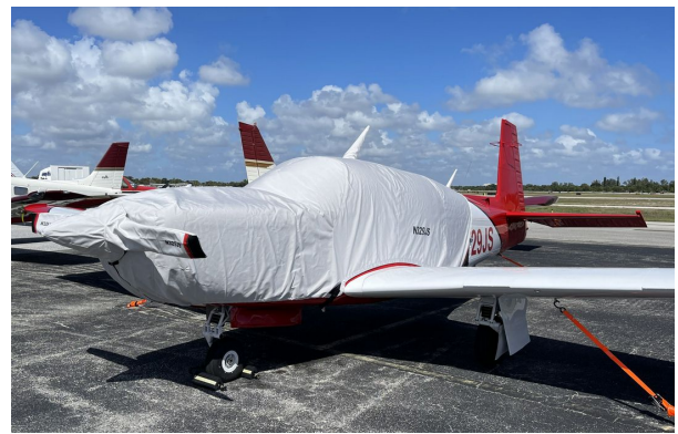
Mooney M20K Extended Canopy/Engine Cover, Prop Cover