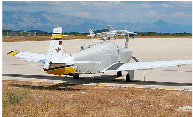
Mooney Extended Canopy/Engine Cover