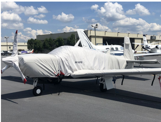
Mooney M20TN Acclaim Full Cover Set

This cover type is made from Silver Acrylic Sunbrella canvas and is 100% lined with a soft and smooth microfiber. Bruce's Custom Covers developed this material combination especially for aircraft protection. The outer material is medium weight and treated for water resistance, UV resistance and anti-static buildup. The inner lining is a very soft and smooth microfiber to prevent scratching. The material is very reflective, and tests show that the cabin interior temperature can be reduced to near-ambient temperature on the hottest of days. It is water, ice and snow repellent, yet breathable to allow moisture to escape from between the cover and the aircraft surface.