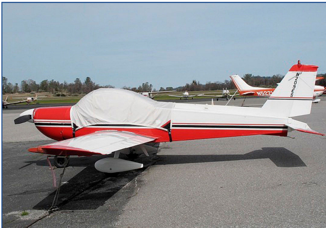
Messerschmitt BO-209 Monsun Canopy Cover