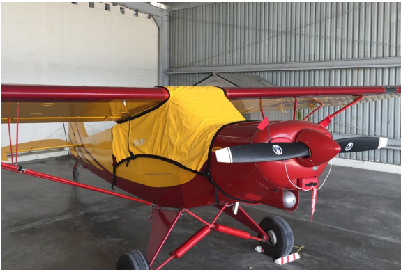
Piper Super Cub Canopy Cover, Engine Plugs