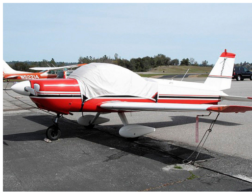
Messerschmitt BO-209 Monsun Canopy Cover