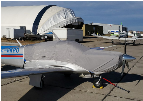
Mooney M20K 231 Travel Weight Canopy/Engine Cover