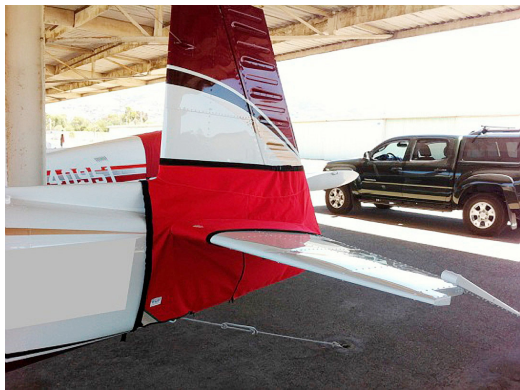
Mooney Tailcone Cover, completely enclosed

WINTER USE MATERIAL - Made with Solution-Dyed Polyester fabric, this option is intended for seasonal use to aid in deicing, rain mitigation, or for occasional travel. The material is lighter and more compact, but more susceptible to UV damage and may have a shorter useful life if used continuously outside than the all-year use material.