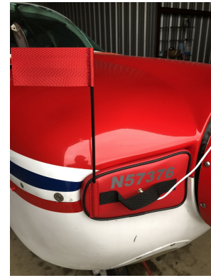
Mooney 201 Engine Inlet Plugs