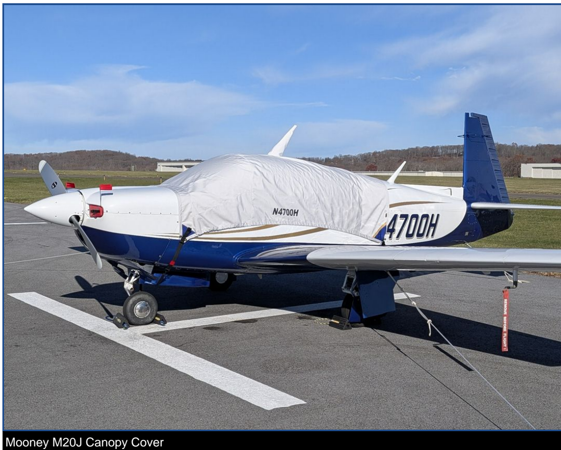
Mooney M20J Canopy Cover