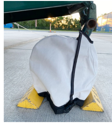
Mooney 201 Nose Wheel Cover