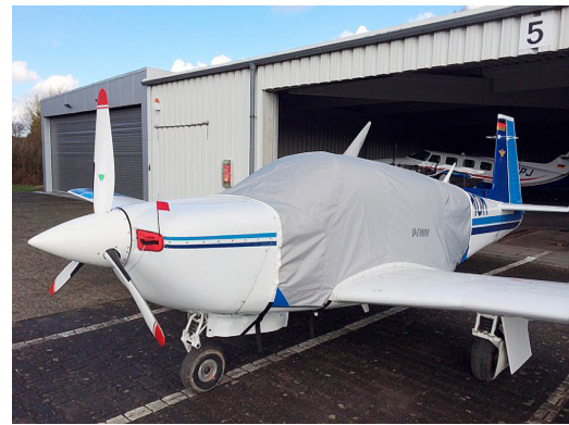
Mooney 201 Light Weight Travel Cover, extended type, and Plugs