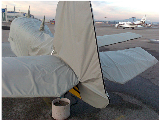
Mooney 231 Full Cover Set: Extra Extended Canopy/Engine Cover, Wing Covers, and Empennage Cover

WINTER USE MATERIAL - Made with Solution-Dyed Polyester fabric, this option is intended for seasonal use to aid in deicing, rain mitigation, or for occasional travel. The material is lighter and more compact, but more susceptible to UV damage and may have a shorter useful life if used continuously outside than the all-year use material.