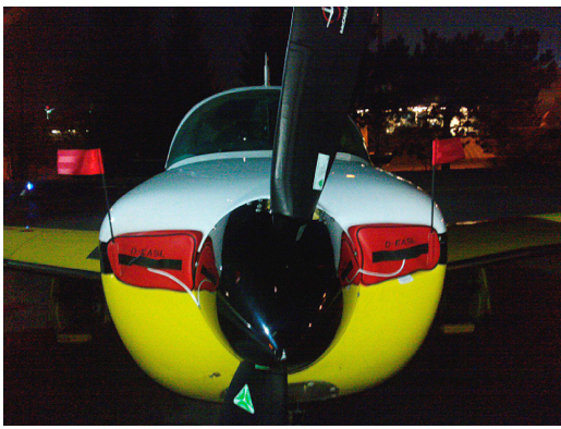
Mooney 231 Engine Inlet Plugs