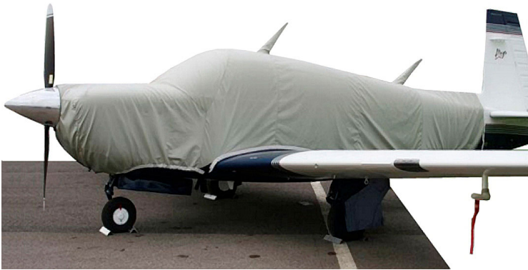
Mooney M20 Extra Extended Canopy/Engine Cover

This cover type is made from Silver Acrylic Sunbrella canvas and is 100% lined with a soft and smooth microfiber. Bruce's Custom Covers developed this material combination especially for aircraft protection. The outer material is medium weight and treated for water resistance, UV resistance and anti-static buildup. The inner lining is a very soft and smooth microfiber to prevent scratching. The material is very reflective, and tests show that the cabin interior temperature can be reduced to near-ambient temperature on the hottest of days. It is water, ice and snow repellent, yet breathable to allow moisture to escape from between the cover and the aircraft surface.