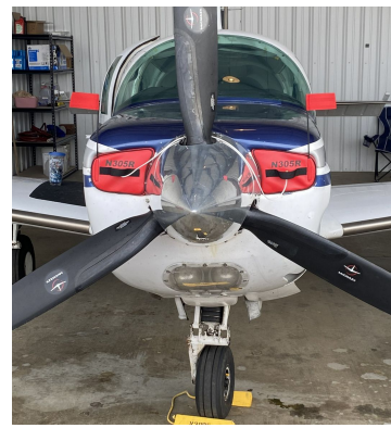
Mooney M20K Rocket Engine Inlet Plugs