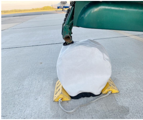
Mooney 201 Nose Wheel Cover