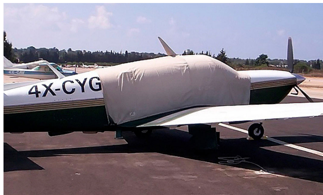
Mooney M20 Extended Canopy Cover