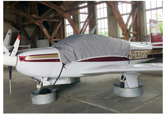
Mooney M20J/M20K Travel Cover