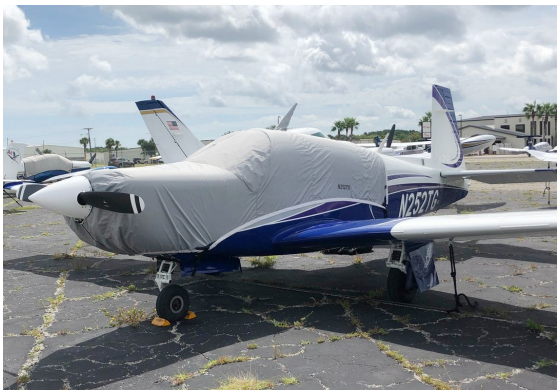
Mooney M20K Travel Weight Canopy/Engine Cover

This cover type is made from Silver Acrylic Sunbrella canvas and is 100% lined with a soft and smooth microfiber. Bruce's Custom Covers developed this material combination especially for aircraft protection. The outer material is medium weight and treated for water resistance, UV resistance and anti-static buildup. The inner lining is a very soft and smooth microfiber to prevent scratching. The material is very reflective, and tests show that the cabin interior temperature can be reduced to near-ambient temperature on the hottest of days. It is water, ice and snow repellent, yet breathable to allow moisture to escape from between the cover and the aircraft surface.