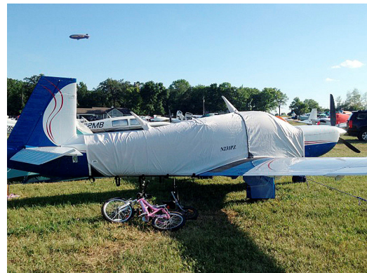
Mooney 231 Extended Canopy Cover & Engine Plugs