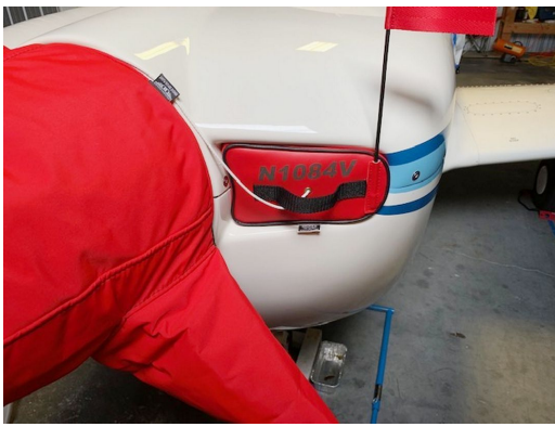
Mooney Engine Inlet Plug & Prop Cover