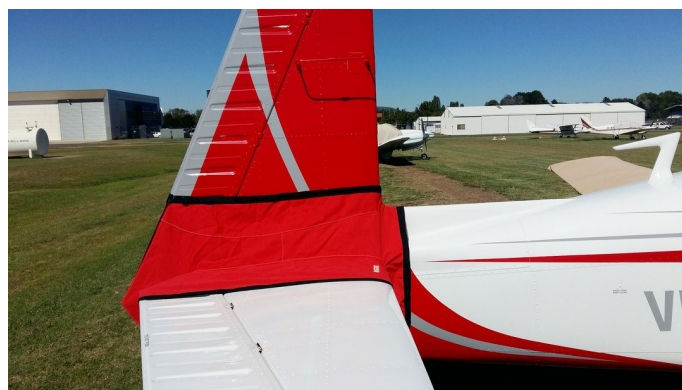
Mooney M20J Tailcone Cover