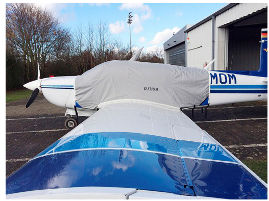
Mooney 201 Light Weight Travel Cover, extended type