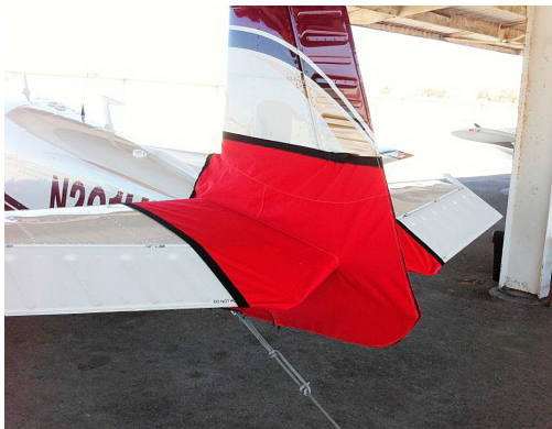
Mooney Tailcone Cover, completely enclosed