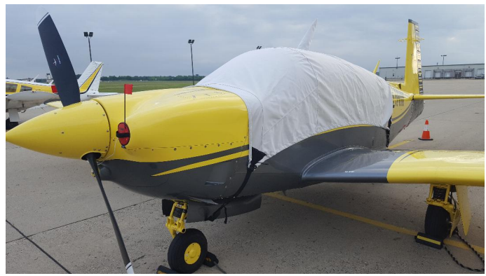
Mooney 201 M20J Canopy Cover, Engine Plugs