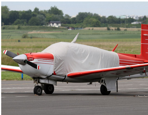
Mooney 201 Extended Canopy Cover, Engine Plugs

This cover type is made from Silver Acrylic Sunbrella canvas and is 100% lined with a soft and smooth microfiber. Bruce's Custom Covers developed this material combination especially for aircraft protection. The outer material is medium weight and treated for water resistance, UV resistance and anti-static buildup. The inner lining is a very soft and smooth microfiber to prevent scratching. The material is very reflective, and tests show that the cabin interior temperature can be reduced to near-ambient temperature on the hottest of days. It is water, ice and snow repellent, yet breathable to allow moisture to escape from between the cover and the aircraft surface.