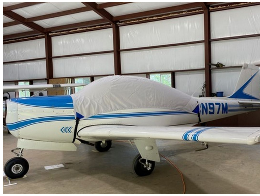
Meyers (Rockwell) 200 Canopy Cover