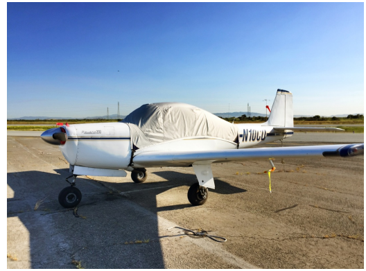
Meyer (Aero Commander) 200 Canopy Cover