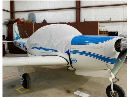
Meyers (Rockwell) 200 Canopy Cover