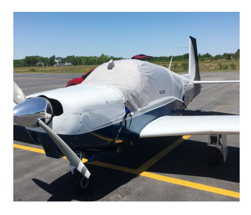
Mooney Early M20 Series Canopy Cover w/Fwd Avionics Panel Cover