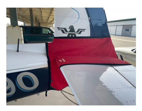
Mooney M20C Tailcone Cover