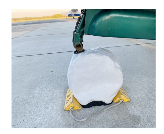
Mooney 201 Nose Wheel Cover

ALL-YEAR USE MATERIAL - Made with Silver Acrylic Sunbrella canvas, the all-year use material is the best option for sun protection and cover longevity. This heavier more durable material is intended for all weather conditions, such as rain and snow or lots of sun.