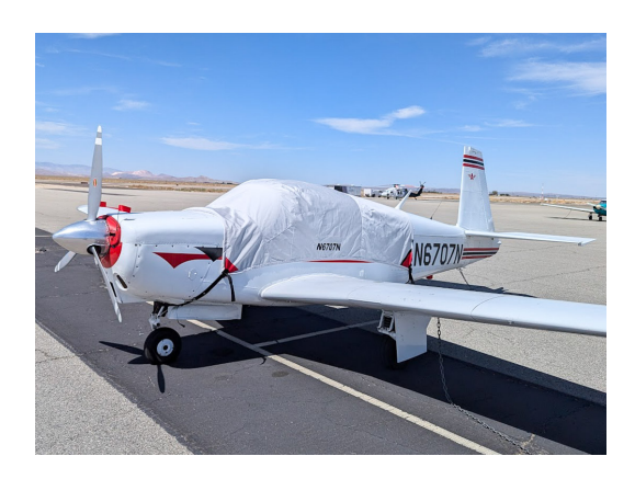
Mooney 20C Extended Canopy/Engine Cover, Tailcone Cover Mooney M20C Canopy Cover with Forward Extension (1965 & up)