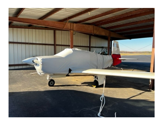
Mooney 20C Extended Canopy/Engine Cover, Tailcone Cover

WINTER USE MATERIAL - Made with Solution-Dyed Polyester fabric, this option is intended for seasonal use to aid in deicing, rain mitigation, or for occasional travel. The material is lighter and more compact, but more susceptible to UV damage and may have a shorter useful life if used continuously outside than the all-year use material.