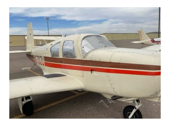
Mooney M20C Heatshield Set

Windshield Heatshields are interior sunshades for an aircraft's front windshield. The product is a unique composite of closed-cell foam with a silver mylar finish. The semi-rigid design is stiff enough to stand along the inside of the windshield using sun visors or window framing. It folds up flat and easily stores in the included storage sleeve. Some designs may require velcro and suction cups or split right and left sides. A Heatshield is an excellent short-term remedy for cockpit overheating. An external fabric cover is far more effective and practical for long-term protection.