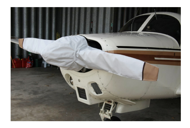
Mooney Early M20 Series Propellor/Spinner Cover, 2 Blade