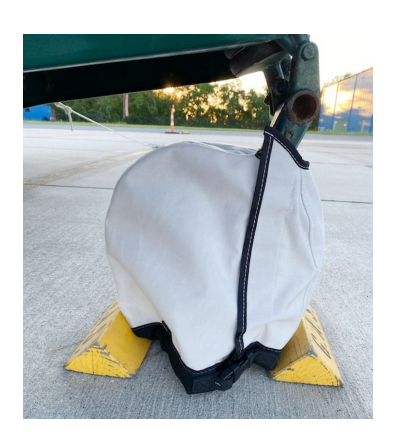
Mooney 201 Nose Wheel Cover