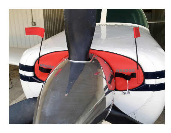
Mooney M20 Engine Inlet Plugs