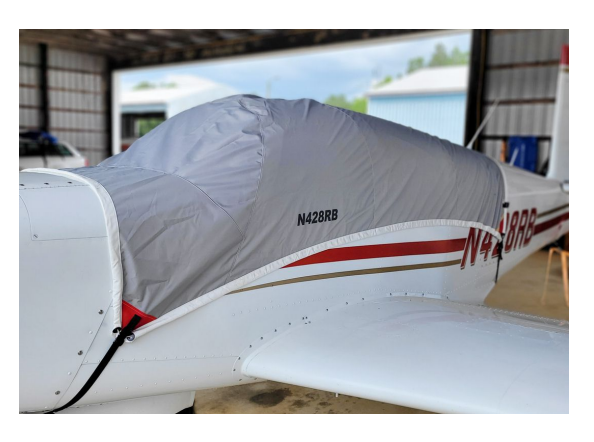
Mooney M20D Travel Weight Canopy Cover