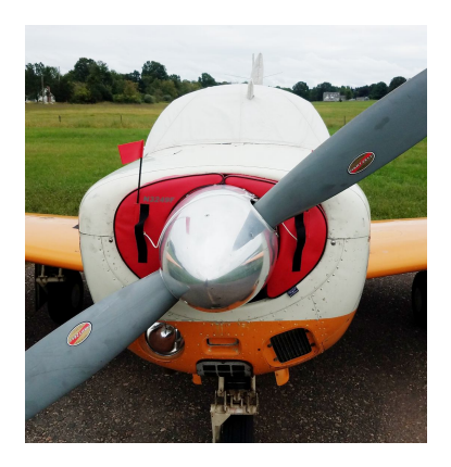
Mooney M20E Engine Inlet Plugs