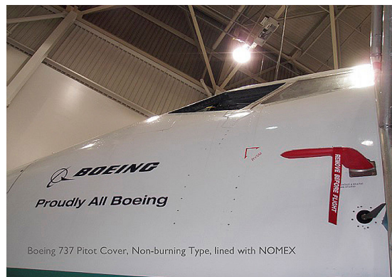
Boeing 737 Heat Resistant Pitot Cover

The Engine Inlet Plugs are custom fit for your Embraer EMB-190/195, Lineage 1000 intakes, made with heavy-duty vinyl material, and stuffed with a single block of sculpted urethane foam. Each plug has a zipper that allows the foam to be removed and dried if necessary. Engine plugs have 'remove before flight' streamers sewn onto the face of the plugs. Most plugs are imprinted with the aircraft registration number in black for an extra charge. Storage bag NOT included. Engine plugs may be inserted after flight when the engine is still warm. Engine Inlet Plugs are commonly referred to as Cowl Plugs, Intake Plugs, Cowl Blocks, Engine Blocks, and Engine Bungs.