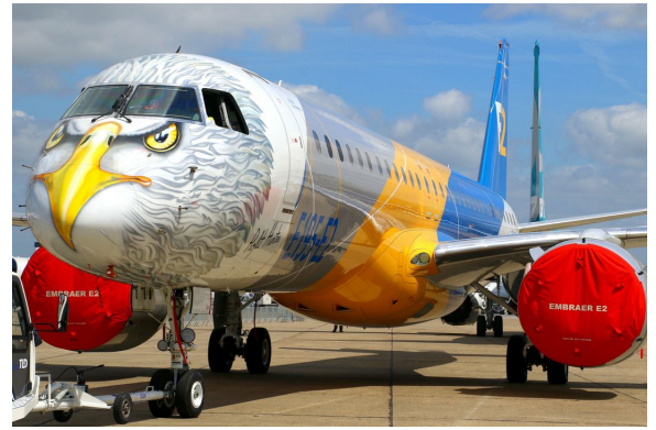
Embraer E195 Intake Covers