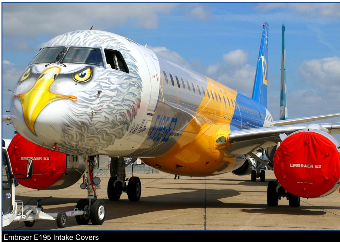
Embraer E195 Intake Covers