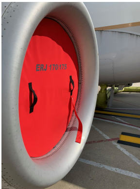
Embraer EMB-170/175 Engine Inlet Plugs

The Engine Inlet Plugs are custom fit for your Embraer EMB-170/175 intakes, made with heavy-duty vinyl material, and stuffed with a single block of sculpted urethane foam. Each plug has a zipper that allows the foam to be removed and dried if necessary. Engine plugs have 'remove before flight' streamers sewn onto the face of the plugs. Most plugs are imprinted with the aircraft registration number in black for an extra charge. Storage bag NOT included. Engine plugs may be inserted after flight when the engine is still warm. Engine Inlet Plugs are commonly referred to as Cowl Plugs, Intake Plugs, Cowl Blocks, Engine Blocks, and Engine Bungs.