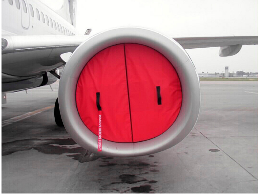
Boeing 737 Engine Intake Plug, Folding Type

ALL-YEAR USE MATERIAL - Made with Silver Acrylic Sunbrella canvas, the all-year use material is the best option for sun protection and cover longevity. This heavier more durable material is intended for all weather conditions, such as rain and snow or lots of sun.