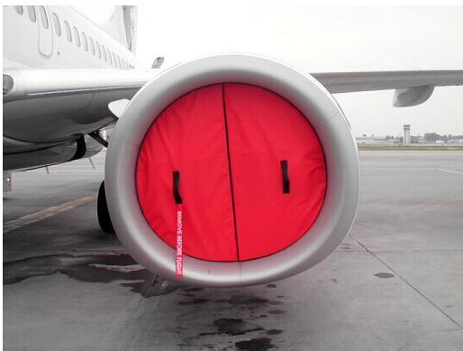
Boeing 737 Engine Intake Plug, Folding Type

The Engine Inlet Plugs are custom fit for your Embraer EMB-170/175 intakes, made with heavy-duty vinyl material, and stuffed with a single block of sculpted urethane foam. Each plug has a zipper that allows the foam to be removed and dried if necessary. Engine plugs have 'remove before flight' streamers sewn onto the face of the plugs. Most plugs are imprinted with the aircraft registration number in black for an extra charge. Storage bag NOT included. Engine plugs may be inserted after flight when the engine is still warm. Engine Inlet Plugs are commonly referred to as Cowl Plugs, Intake Plugs, Cowl Blocks, Engine Blocks, and Engine Bungs.