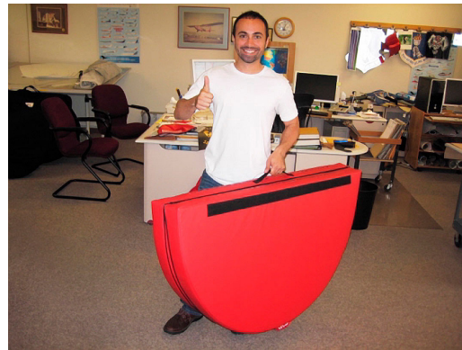
Boeing 737 FOD protection Intake Plug, folding type