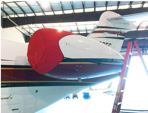
Canadair Challenger 300 Intake/Exhaust Covers, 3-Strap Type

The Embraer ERJ-135/140/145 Legacy 600, 650 Intake Covers are designed to install easily yet be completely storable. A spring steel hoop is sewn into the hem of each cover, allowing them to be installed without climbing onto the wing or using a stepladder. To store the covers the spring steel hoop folds like a band-saw blade into three nesting rings. Each cover folds into a compact circular bundle which is stored in the included duffle bag, yet they unfold quickly for use. The Tri-Fold Ring cover is made of medium weight nylon which is available in a variety of colors to match the paint trim. Each cover set comes complete with installation and folding instructions. The aircraft's registration number can be silkscreened onto the cover for an extra charge.