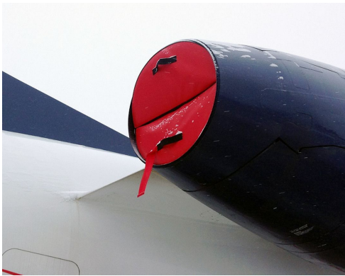
Embraer Legacy 650 Exhaust Plug

The Engine Inlet Plugs are custom fit for your Embraer ERJ-135/140/145 Legacy 600, 650 intakes, made with heavy-duty vinyl material, and stuffed with a single block of sculpted urethane foam. Each plug has a zipper that allows the foam to be removed and dried if necessary. Engine plugs have 'remove before flight' streamers sewn onto the face of the plugs. Most plugs are imprinted with the aircraft registration number in black for an extra charge. Storage bag NOT included. Engine plugs may be inserted after flight when the engine is still warm. Engine Inlet Plugs are commonly referred to as Cowl Plugs, Intake Plugs, Cowl Blocks, Engine Blocks, and Engine Bungs.