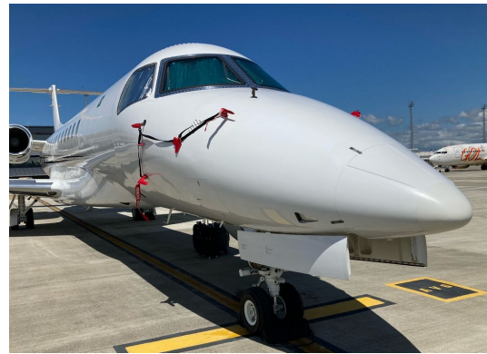
Embraer ERJ-135 Pitot/TAT/Ice Detector Covers