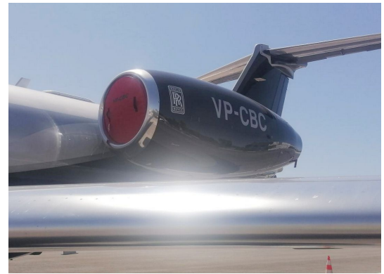
Embraer 135 Engine Inlet Plugs