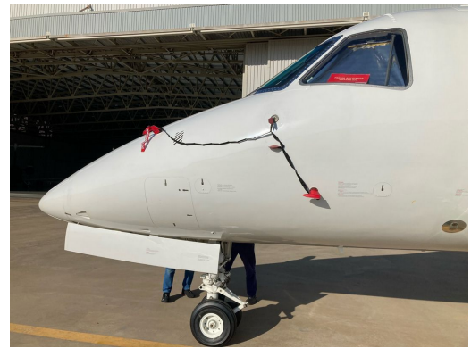
Embraer ERJ-135 Pitot/TAT/Ice Detector Covers