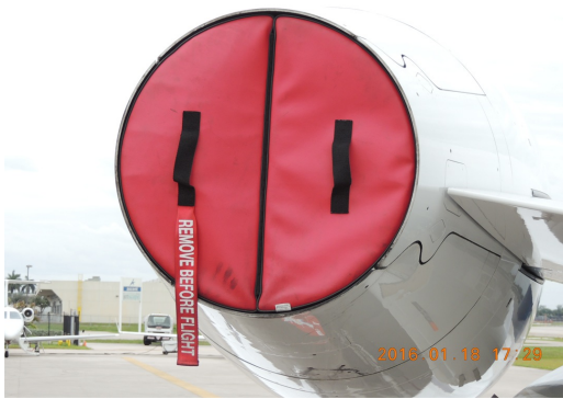
Embraer Legacy 500 Engine Exhaust Plug, folding type

The Engine Inlet Plugs are custom fit for your Embraer ERJ-135/140/145 Legacy 600, 650 intakes, made with heavy-duty vinyl material, and stuffed with a single block of sculpted urethane foam. Each plug has a zipper that allows the foam to be removed and dried if necessary. Engine plugs have 'remove before flight' streamers sewn onto the face of the plugs. Most plugs are imprinted with the aircraft registration number in black for an extra charge. Storage bag NOT included. Engine plugs may be inserted after flight when the engine is still warm. Engine Inlet Plugs are commonly referred to as Cowl Plugs, Intake Plugs, Cowl Blocks, Engine Blocks, and Engine Bungs.