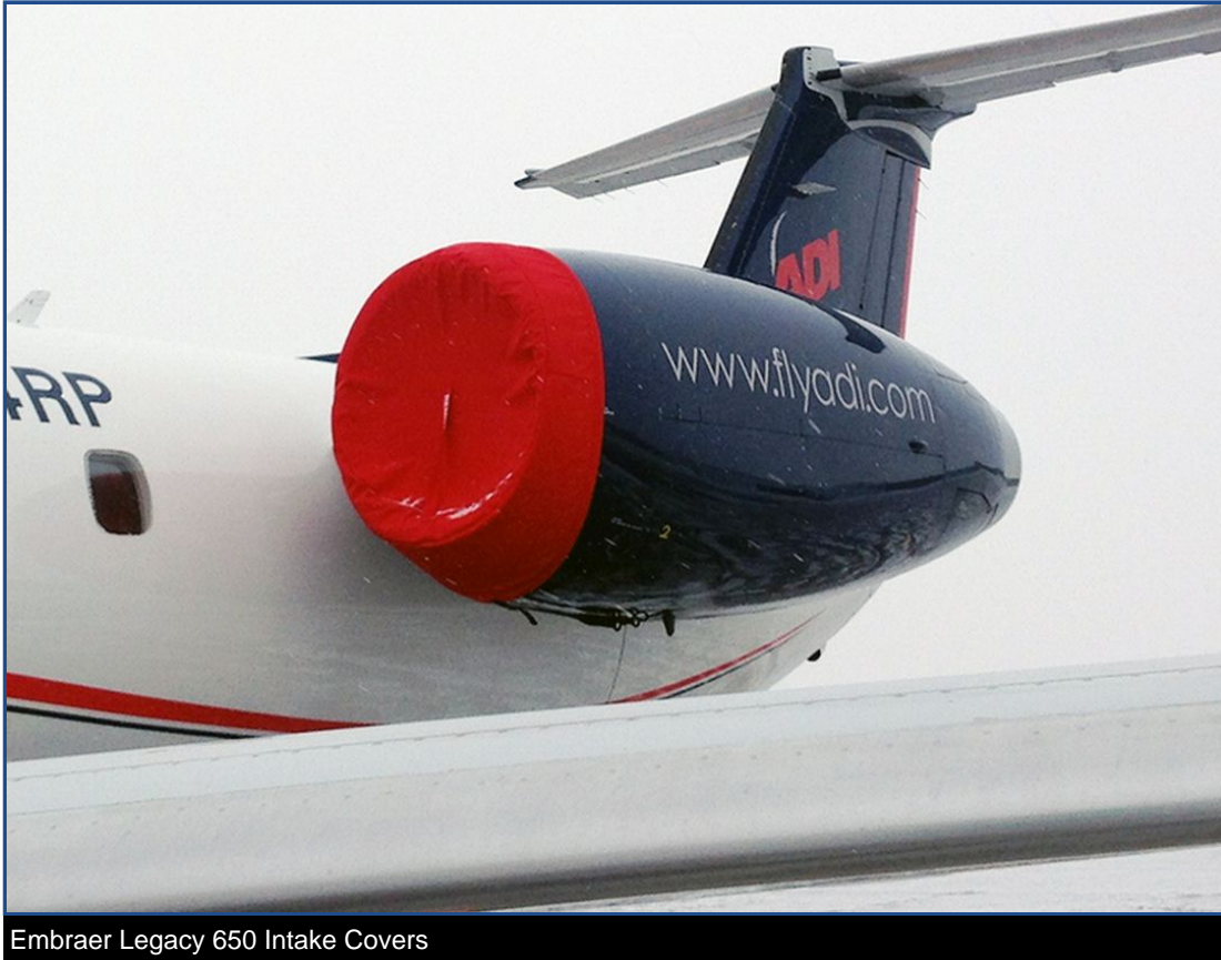
Embraer Legacy 650 Intake Covers