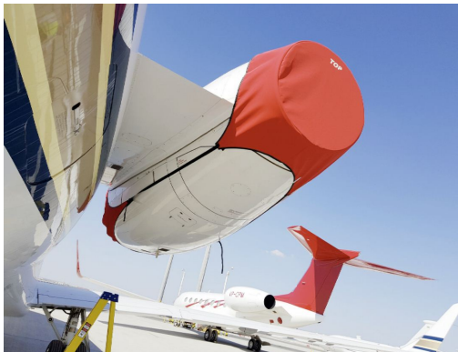
Embraer ERJ-135/140/145 Legacy 650 3-Strap Intake/Exhaust Cover

The Embraer ERJ-135/140/145 Legacy 600, 650 Intake Covers are designed to install easily yet be completely storable. A spring steel hoop is sewn into the hem of each cover, allowing them to be installed without climbing onto the wing or using a stepladder. To store the covers the spring steel hoop folds like a band-saw blade into three nesting rings. Each cover folds into a compact circular bundle which is stored in the included duffle bag, yet they unfold quickly for use. The Tri-Fold Ring cover is made of medium weight nylon which is available in a variety of colors to match the paint trim. Each cover set comes complete with installation and folding instructions. The aircraft's registration number can be silkscreened onto the cover for an extra charge.