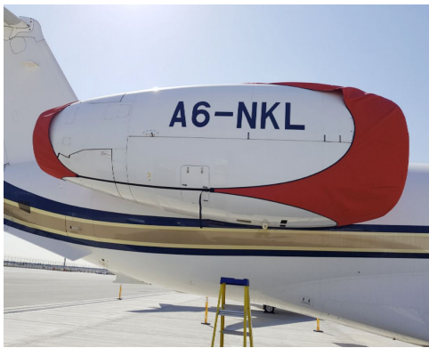
Embraer ERJ-135/140/145 Legacy 650 3-Strap Intake/Exhaust Cover

The Embraer ERJ-135/140/145 Legacy 600, 650 Intake Covers are designed to install easily yet be completely storable. A spring steel hoop is sewn into the hem of each cover, allowing them to be installed without climbing onto the wing or using a stepladder. To store the covers the spring steel hoop folds like a band-saw blade into three nesting rings. Each cover folds into a compact circular bundle which is stored in the included duffle bag, yet they unfold quickly for use. The Tri-Fold Ring cover is made of medium weight nylon which is available in a variety of colors to match the paint trim. Each cover set comes complete with installation and folding instructions. The aircraft's registration number can be silkscreened onto the cover for an extra charge.