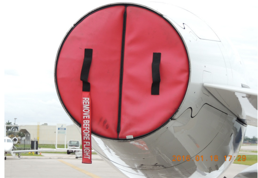
Embraer Legacy 500 Engine Exhaust Plug, folding type