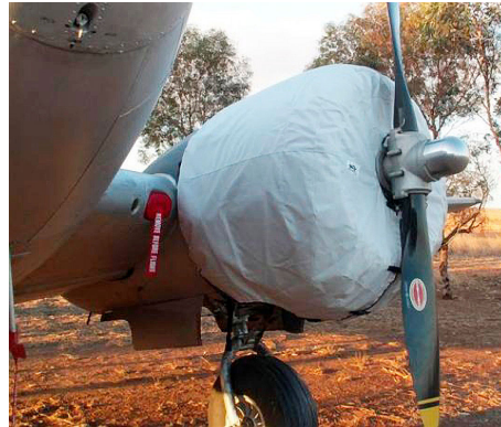
Beech D-18 Engine Covers, Center Section Oil Cooler Inlet Plugs, and Pitot Covers

This cover type is made from Silver Acrylic Sunbrella canvas and is 100% lined with a soft and smooth microfiber. Bruce's Custom Covers developed this material combination especially for aircraft protection. The outer material is medium weight and treated for water resistance, UV resistance and anti-static buildup. The inner lining is a very soft and smooth microfiber to prevent scratching. The material is very reflective, and tests show that the cabin interior temperature can be reduced to near-ambient temperature on the hottest of days. It is water, ice and snow repellent, yet breathable to allow moisture to escape from between the cover and the aircraft surface.