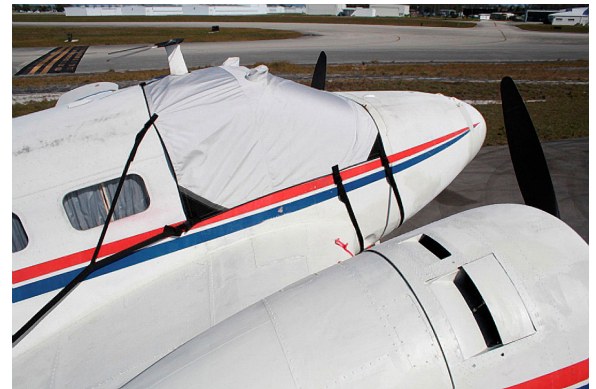
Beech 18 Cockpit Cover