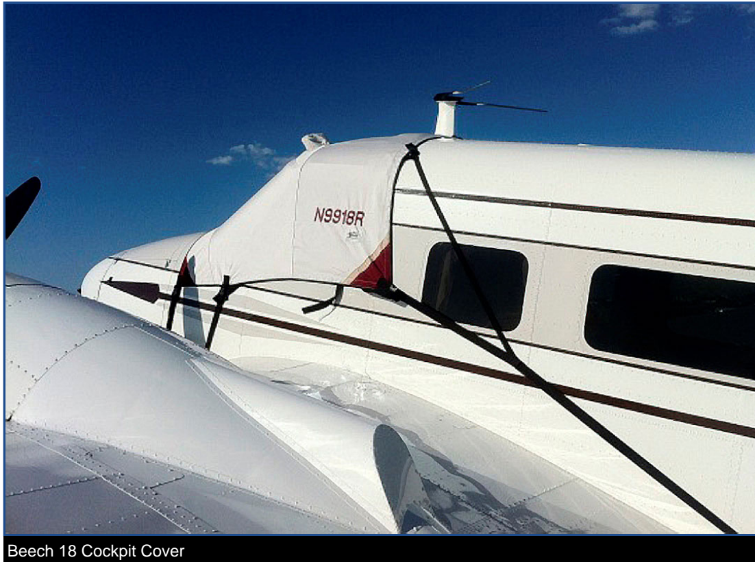
Beech 18 Cockpit Cover