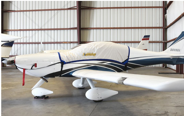
Arion Lightning, LS-1, XS Canopy Cover