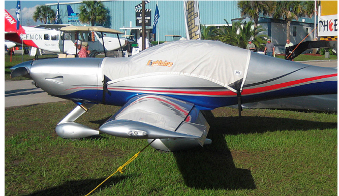
Lightning Canopy Cover