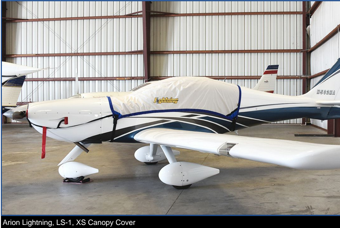
Arion Lightning, LS-1, XS Canopy Cover