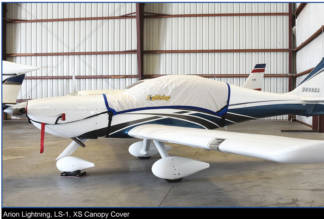
Arion Lightning, LS-1, XS Canopy Cover