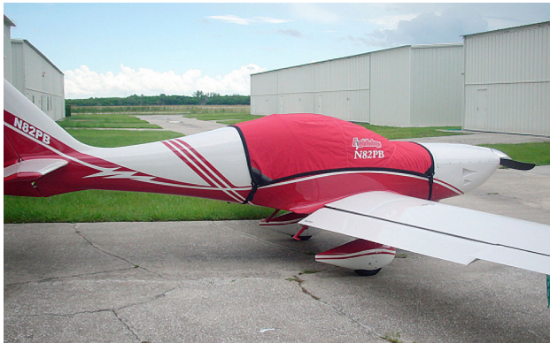
Lightning Canopy Cover

This cover type is made from Silver Acrylic Sunbrella canvas and is 100% lined with a soft and smooth microfiber. Bruce's Custom Covers developed this material combination especially for aircraft protection. The outer material is medium weight and treated for water resistance, UV resistance and anti-static buildup. The inner lining is a very soft and smooth microfiber to prevent scratching. The material is very reflective, and tests show that the cabin interior temperature can be reduced to near-ambient temperature on the hottest of days. It is water, ice and snow repellent, yet breathable to allow moisture to escape from between the cover and the aircraft surface.