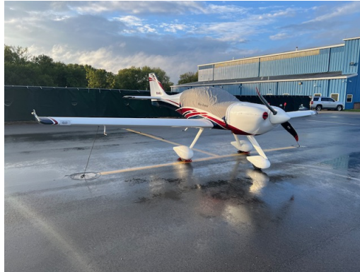
Lightning, XS, Travel Cover, Light Weight Canopy Cover

Travel Covers are made with Silver Solution-Dyed Polyester fabric and only lined over the windshield to save weight. The material is lightweight and more compact for easy stowage in the aircraft. The polyester material is water resistant, but only intended for occasional use outside. We also have an ultra lightweight material available for fitted hangar dust covers. For daily outdoor use, the non-travel Sunbrella Cover is the best choice.