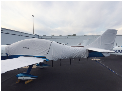
Lancair ES Wing Covers & Empennage Cover (sold separately)

WINTER USE MATERIAL - Made with Solution-Dyed Polyester fabric, this option is intended for seasonal use to aid in deicing, rain mitigation, or for occasional travel. The material is lighter and more compact, but more susceptible to UV damage and may have a shorter useful life if used continuously outside than the all-year use material.