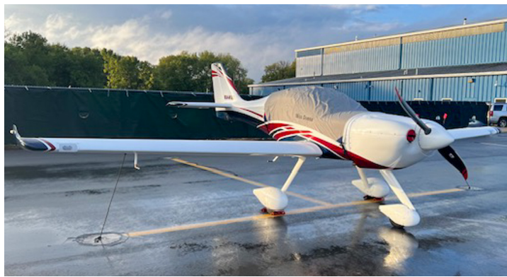
Lightning, XS, Travel Cover, Light Weight Canopy Cover