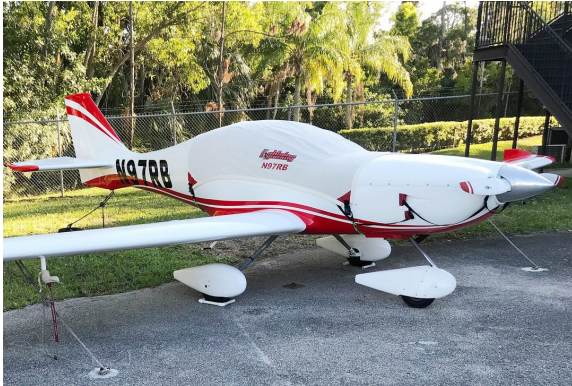
Arion Lightning Canopy Cover,

This cover type is made from Silver Acrylic Sunbrella canvas and is 100% lined with a soft and smooth microfiber. Bruce's Custom Covers developed this material combination especially for aircraft protection. The outer material is medium weight and treated for water resistance, UV resistance and anti-static buildup. The inner lining is a very soft and smooth microfiber to prevent scratching. The material is very reflective, and tests show that the cabin interior temperature can be reduced to near-ambient temperature on the hottest of days. It is water, ice and snow repellent, yet breathable to allow moisture to escape from between the cover and the aircraft surface.