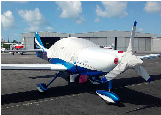
Lancair Canopy Cover, Plugs & Prop Cover

Engine Inlet Plugs are custom fit for your Lancair ES intakes, made with heavy-duty vinyl material, and stuffed with a single block of sculpted urethane foam. Each plug has a zipper that allows the foam to be removed and dried if necessary. Engine plugs have warning flags that are visible from the cockpit or 'remove before flight' streamers sewn onto the face of the plugs. Most plugs are imprinted with the aircraft registration number in black for an extra charge. Storage bag NOT included. Engine plugs may be inserted after flight when the engine is still warm. Engine Inlet Plugs are commonly referred to as Cowl Plugs, Intake Plugs, Cowl Blocks, Engine Blocks, and Engine Bungs.