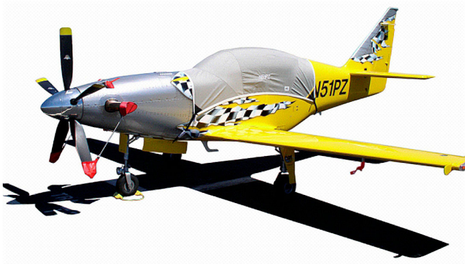
Legend Canopy Cover, Prop Ties, Exhaust Covers & Intake Plugs

This cover type is made from Silver Acrylic Sunbrella canvas and is 100% lined with a soft and smooth microfiber. Bruce's Custom Covers developed this material combination especially for aircraft protection. The outer material is medium weight and treated for water resistance, UV resistance and anti-static buildup. The inner lining is a very soft and smooth microfiber to prevent scratching. The material is very reflective, and tests show that the cabin interior temperature can be reduced to near-ambient temperature on the hottest of days. It is water, ice and snow repellent, yet breathable to allow moisture to escape from between the cover and the aircraft surface.