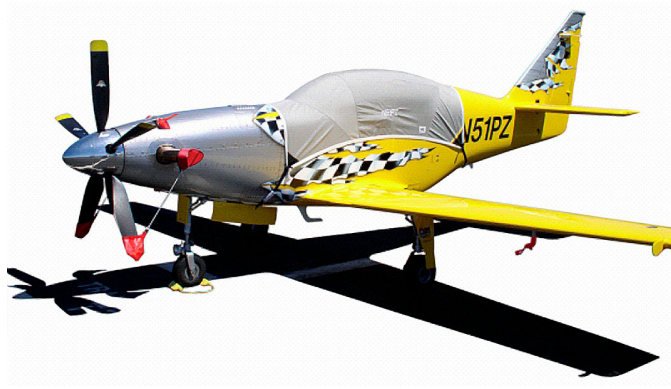
Legend Canopy Cover, Prop Ties, Exhaust Covers & Intake Plugs