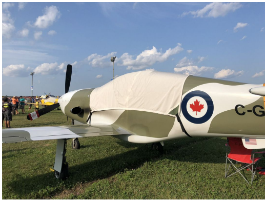
Legend Canopy Cover

the hottest of days. It is water, ice and snow repellent, yet breathable to allow moisture to escape from between the cover and the aircraft surface.