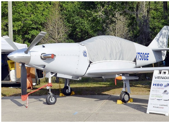
Turbine Legend Canopy Cover