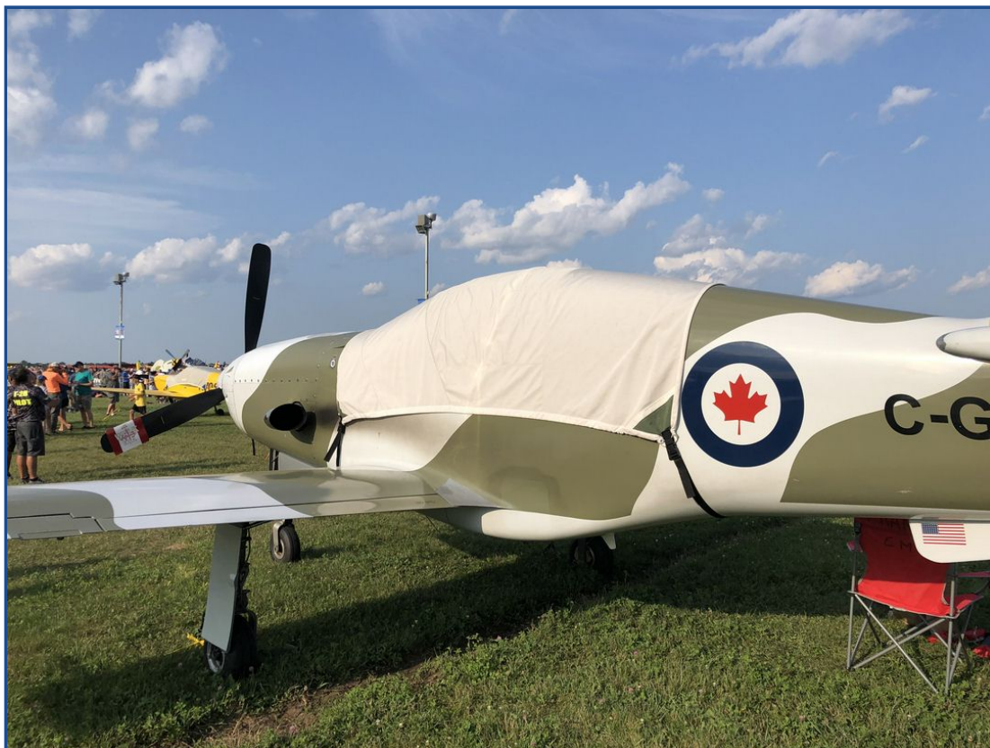
Legend Canopy Cover