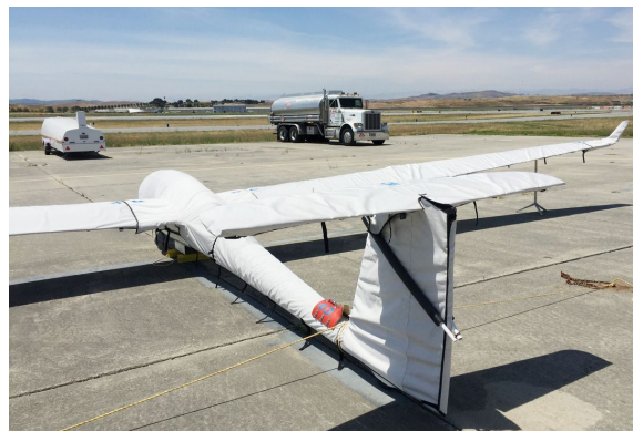
Schemp-Hirth Discus 2B Full Cover Set