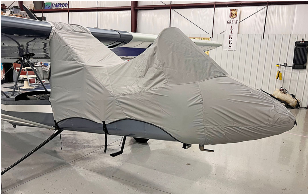
AirCam Gen 2 Travel Cover, Light weight travel canopy/nose cover