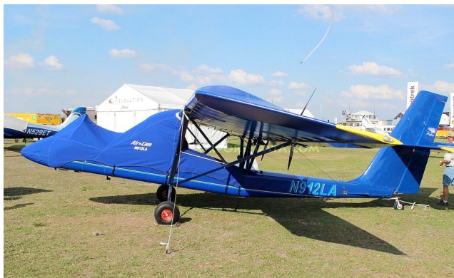
Lockwood AirCam Canopy/Nose/Baggage Area Cover, with aft bubble windshield