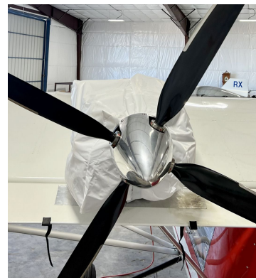
Lockwood Air Cam Engine Cover, test fit cover