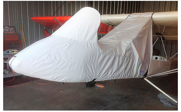
Lockwood AirCam Canopy/Nose Cover