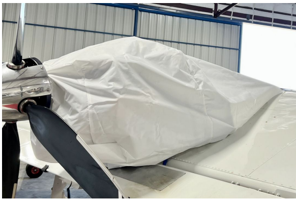
Lockwood Air Cam Engine Cover, test fit cover