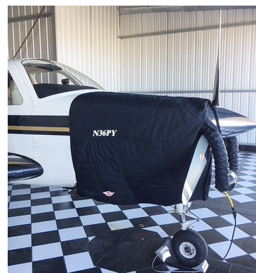
Beech Bonanza 36 Models Insulated Engine Cover