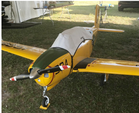
Beechcraft T-34B Mentor Canopy Cover, for 36% Scale Model

Travel Covers are made with Silver Solution-Dyed Polyester fabric and only lined over the windshield to save weight. The material is lightweight and more compact for easy stowage in the aircraft. The polyester material is water resistant, but only intended for occasional use outside. We also have an ultra lightweight material available for fitted hangar dust covers. For daily outdoor use, the non-travel Sunbrella Cover is the best choice.