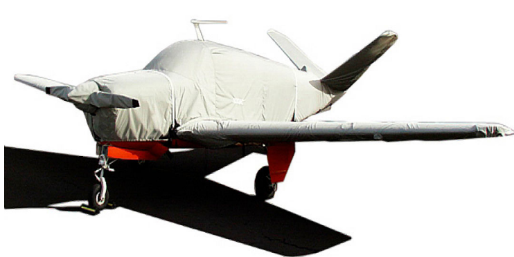
Beech Bonanza Full Cover Set

WINTER USE MATERIAL - Made with Solution-Dyed Polyester fabric, this option is intended for seasonal use to aid in deicing, rain mitigation, or for occasional travel. The material is lighter and more compact, but more susceptible to UV damage and may have a shorter useful life if used continuously outside than the all-year use material.