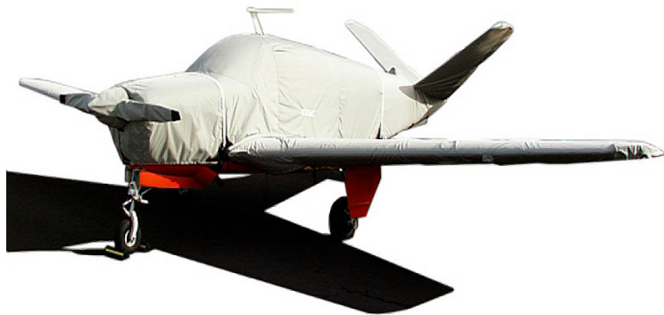
Beech Bonanza Full Cover Set

This cover type is made from Silver Acrylic Sunbrella canvas and is 100% lined with a soft and smooth microfiber. Bruce's Custom Covers developed this material combination especially for aircraft protection. The outer material is medium weight and treated for water resistance, UV resistance and anti-static buildup. The inner lining is a very soft and smooth microfiber to prevent scratching. The material is very reflective, and tests show that the cabin interior temperature can be reduced to near-ambient temperature on the hottest of days. It is water, ice and snow repellent, yet breathable to allow moisture to escape from between the cover and the aircraft surface.