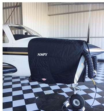
Beech Bonanza 36 Models Insulated Engine Cover