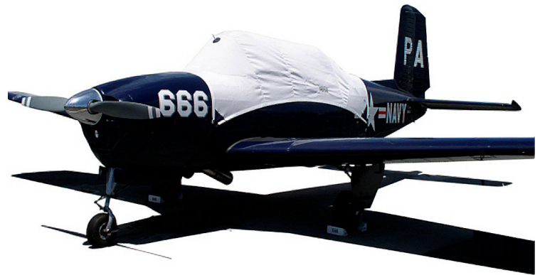
The T34 Canopy Cover