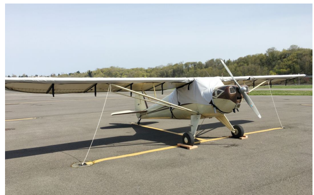
Luscombe Over-Top Canopy Cover & Wing Covers