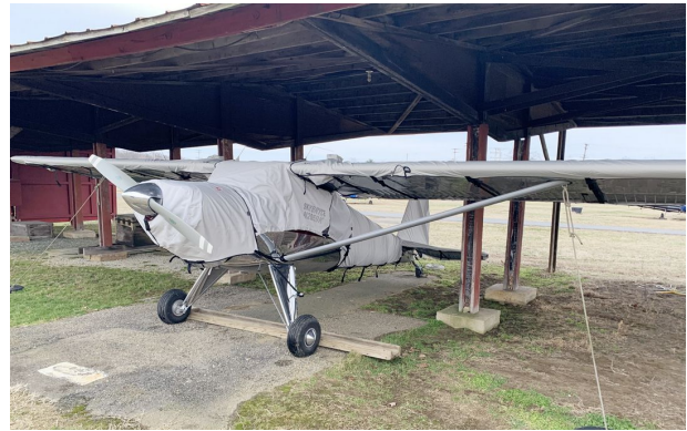
Luscombe Canopy, Wings, Engine & Empennage Covers