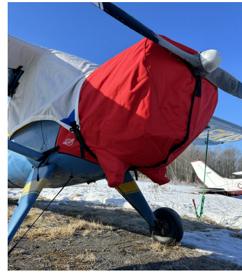
Luscombe 8E Canopy Cover w/Wing Extensions, Insulated Engine Cover