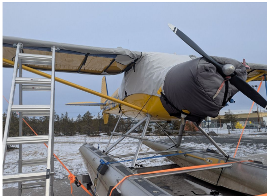
Luscombe 8A-8F Silvaire Winter Cover Set

This cover type is made from Silver Acrylic Sunbrella canvas and is 100% lined with a soft and smooth microfiber. Bruce's Custom Covers developed this material combination especially for aircraft protection. The outer material is medium weight and treated for water resistance, UV resistance and anti-static buildup. The inner lining is a very soft and smooth microfiber to prevent scratching. The material is very reflective, and tests show that the cabin interior temperature can be reduced to near-ambient temperature on the hottest of days. It is water, ice and snow repellent, yet breathable to allow moisture to escape from between the cover and the aircraft surface.