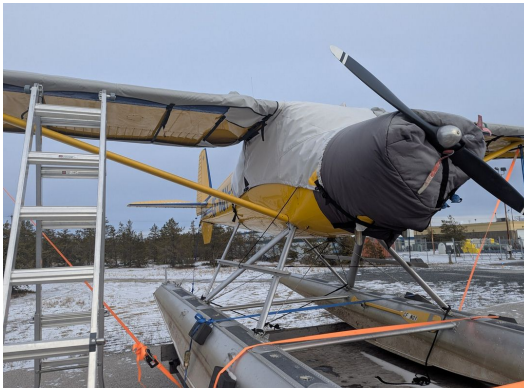
Luscombe 8A-8F Silvaire Winter Cover Set

WINTER USE MATERIAL - Made with Solution-Dyed Polyester fabric, this option is intended for seasonal use to aid in deicing, rain mitigation, or for occasional travel. The material is lighter and more compact, but more susceptible to UV damage and may have a shorter useful life if used continuously outside than the all-year use material.