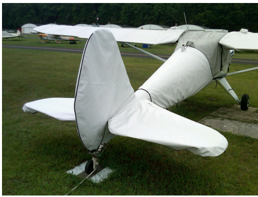
Luscombe Empennage Cover, two-piece design