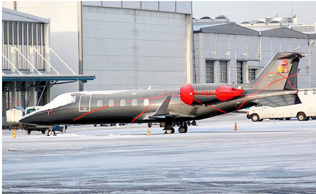
Learjet 60 Engine Cover set