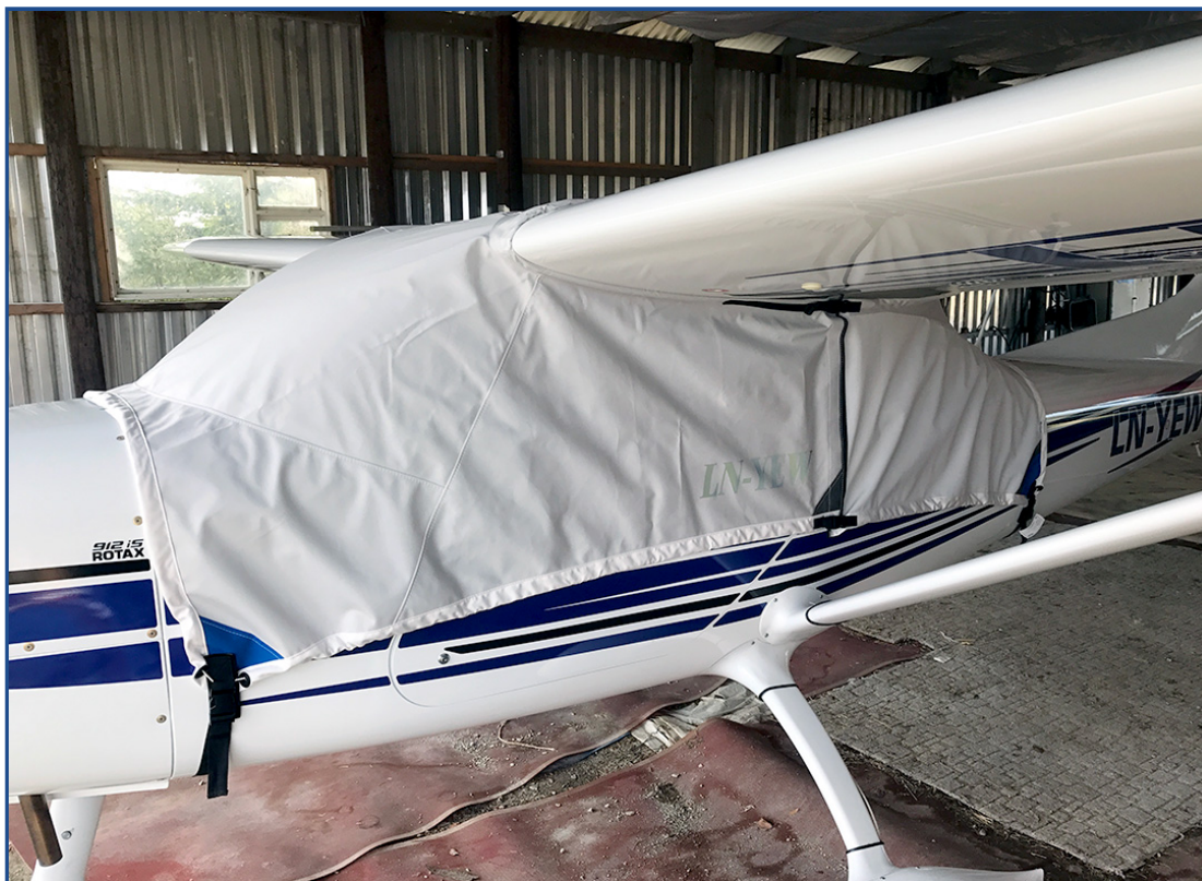
TL Ultralight Sirius TL-3000 Canopy Cover (Over-The-Top Style)