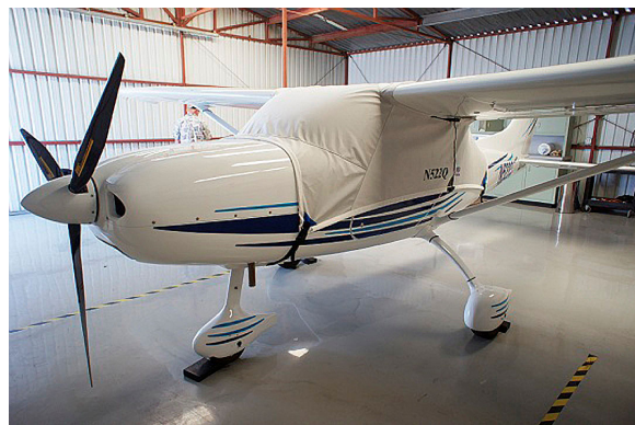
TL Ultralight Sirius Canopy Cover