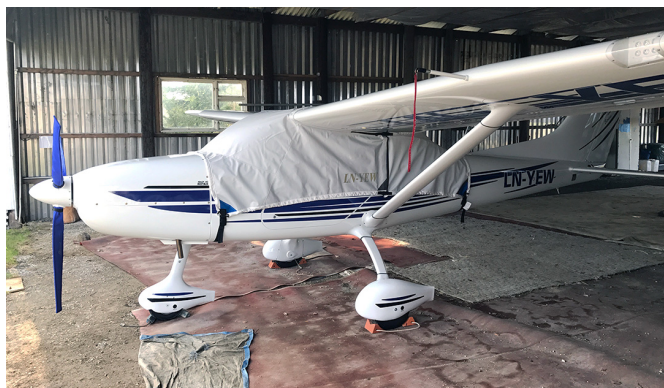
TL Ultralight Sirius TL-3000 Canopy Cover (Over-The-Top Style)

This cover type is made from Silver Acrylic Sunbrella canvas and is 100% lined with a soft and smooth microfiber. Bruce's Custom Covers developed this material combination especially for aircraft protection. The outer material is medium weight and treated for water resistance, UV resistance and anti-static buildup. The inner lining is a very soft and smooth microfiber to prevent scratching. The material is very reflective, and tests show that the cabin interior temperature can be reduced to near-ambient temperature on the hottest of days. It is water, ice and snow repellent, yet breathable to allow moisture to escape from between the cover and the aircraft surface.