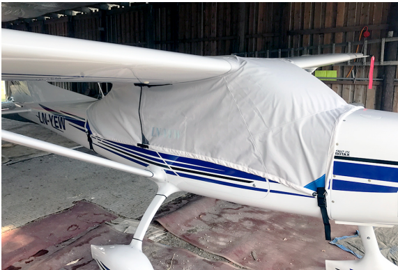
TL Ultralight Sirius TL-3000 Canopy Cover (Over-The-Top Style) TL Ultralight Sirius TL-3000 Canopy Cover (Over-The-Top Style)