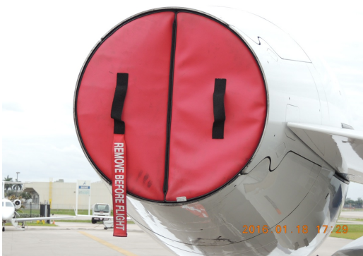
Embraer Legacy 500 Engine Exhaust Plug, folding type

The Engine Inlet Plugs are custom fit for your Embraer Legacy 500 Praetor, (EMB-545/550) intakes, made with heavy-duty vinyl material, and stuffed with a single block of sculpted urethane foam. Each plug has a zipper that allows the foam to be removed and dried if necessary. Engine plugs have 'remove before flight' streamers sewn onto the face of the plugs. Most plugs are imprinted with the aircraft registration number in black for an extra charge. Storage bag NOT included. Engine plugs may be inserted after flight when the engine is still warm. Engine Inlet Plugs are commonly referred to as Cowl Plugs, Intake Plugs, Cowl Blocks, Engine Blocks, and Engine Bungs.