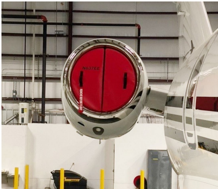
Embraer Legacy 500 Engine Inlet Plugs, folding type

The Engine Inlet Plugs are custom fit for your Embraer Legacy 500 Praetor, (EMB-545/550) intakes, made with heavy-duty vinyl material, and stuffed with a single block of sculpted urethane foam. Each plug has a zipper that allows the foam to be removed and dried if necessary. Engine plugs have 'remove before flight' streamers sewn onto the face of the plugs. Most plugs are imprinted with the aircraft registration number in black for an extra charge. Storage bag NOT included. Engine plugs may be inserted after flight when the engine is still warm. Engine Inlet Plugs are commonly referred to as Cowl Plugs, Intake Plugs, Cowl Blocks, Engine Blocks, and Engine Bungs.