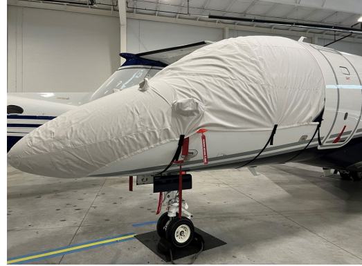
Embraer Legacy 500, (EMB-550) Cockpit/Nose Cover