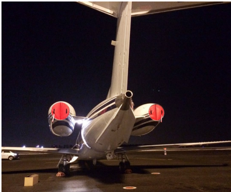
Embraer Legacy Exhaust Plugs

The Engine Inlet Plugs are custom fit for your Embraer Legacy 500 Praetor, (EMB-545/550) intakes, made with heavy-duty vinyl material, and stuffed with a single block of sculpted urethane foam. Each plug has a zipper that allows the foam to be removed and dried if necessary. Engine plugs have 'remove before flight' streamers sewn onto the face of the plugs. Most plugs are imprinted with the aircraft registration number in black for an extra charge. Storage bag NOT included. Engine plugs may be inserted after flight when the engine is still warm. Engine Inlet Plugs are commonly referred to as Cowl Plugs, Intake Plugs, Cowl Blocks, Engine Blocks, and Engine Bungs.