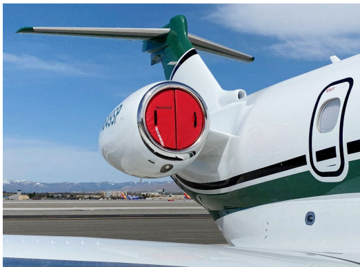
Embraer S A EMB-545 Engine Inlet & Exhaust Plug Set (folding type)

The Engine Inlet Plugs are custom fit for your Embraer Legacy 500 Praetor, (EMB-545/550) intakes, made with heavy-duty vinyl material, and stuffed with a single block of sculpted urethane foam. Each plug has a zipper that allows the foam to be removed and dried if necessary. Engine plugs have 'remove before flight' streamers sewn onto the face of the plugs. Most plugs are imprinted with the aircraft registration number in black for an extra charge. Storage bag NOT included. Engine plugs may be inserted after flight when the engine is still warm. Engine Inlet Plugs are commonly referred to as Cowl Plugs, Intake Plugs, Cowl Blocks, Engine Blocks, and Engine Bungs.