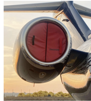
Legacy 500 Folding Intake Plugs