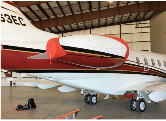
Canadair Challenger 300 Intake/Exhaust Covers, 3-Strap Type