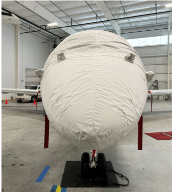
Embraer Legacy 500, (EMB-550) Cockpit/Nose Cover

This cover type is made from Silver Acrylic Sunbrella canvas and is 100% lined with a soft and smooth microfiber. Bruce's Custom Covers developed this material combination especially for aircraft protection. The outer material is medium weight and treated for water resistance, UV resistance and anti-static buildup. The inner lining is a very soft and smooth microfiber to prevent scratching. The material is very reflective, and tests show that the cabin interior temperature can be reduced to near-ambient temperature on the hottest of days. It is water, ice and snow repellent, yet breathable to allow moisture to escape from between the cover and the aircraft surface.