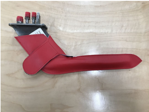
Lear 55 Pitot Cover