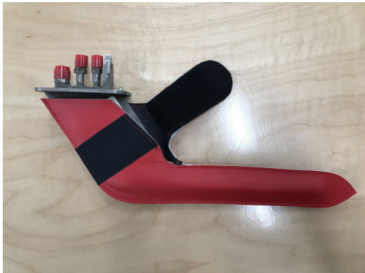
Lear 55 Pitot Cover

The Engine Inlet Plugs are custom fit for your Lear 55 intakes, made with heavy-duty vinyl material, and stuffed with a single block of sculpted urethane foam. Each plug has a zipper that allows the foam to be removed and dried if necessary. Engine plugs have 'remove before flight' streamers sewn onto the face of the plugs. Most plugs are imprinted with the aircraft registration number in black for an extra charge. Storage bag NOT included. Engine plugs may be inserted after flight when the engine is still warm. Engine Inlet Plugs are commonly referred to as Cowl Plugs, Intake Plugs, Cowl Blocks, Engine Blocks, and Engine Bungs.