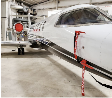
Lear 45 Intake/Exhaust Plug Set

The Engine Inlet Plugs are custom fit for your Lear Models 40 & 45 intakes, made with heavy-duty vinyl material, and stuffed with a single block of sculpted urethane foam. Each plug has a zipper that allows the foam to be removed and dried if necessary. Engine plugs have 'remove before flight' streamers sewn onto the face of the plugs. Most plugs are imprinted with the aircraft registration number in black for an extra charge. Storage bag NOT included. Engine plugs may be inserted after flight when the engine is still warm. Engine Inlet Plugs are commonly referred to as Cowl Plugs, Intake Plugs, Cowl Blocks, Engine Blocks, and Engine Bungs.