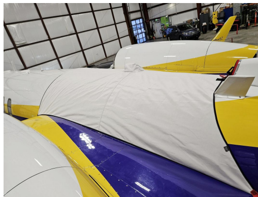
Lear 45 Empennage Saddle Cover W/ Dorsal Inlet Plug (Covers Upper Fuselage Between Pylons, Acm/Apu Area)