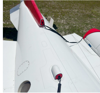
Lear 45 Dorsal, ACM & Fuel Vent Inlet Plugs