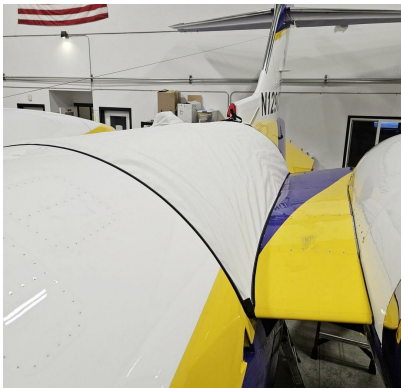
Lear 45 Empennage Saddle Cover W/ Dorsal Inlet Plug (Covers Upper Fuselage Between Pylons, Acm/Apu Area)