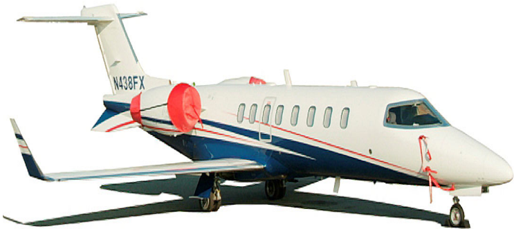
Lear 45 Engine Covers & Pitot/Rosemont Cover set