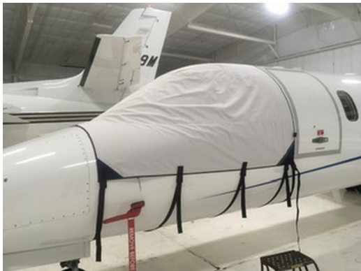
Lear 45 Cockpit Cover

This cover type is made from Silver Acrylic Sunbrella canvas and is 100% lined with a soft and smooth microfiber. Bruce's Custom Covers developed this material combination especially for aircraft protection. The outer material is medium weight and treated for water resistance, UV resistance and anti-static buildup. The inner lining is a very soft and smooth microfiber to prevent scratching. The material is very reflective, and tests show that the cabin interior temperature can be reduced to near-ambient temperature on the hottest of days. It is water, ice and snow repellent, yet breathable to allow moisture to escape from between the cover and the aircraft surface.