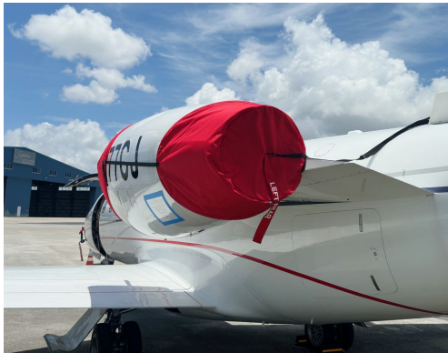
Lear 45 Engine Covers

The Lear Models 40 & 45 Bikini Style Engine Covers are a single-piece design using a soft and smooth stretchy and fabric. The cover stretches tightly over both the intake and exhaust, installing quickly and easily. These covers are designed to be used as hangar dust covers and have a useful life of approximately one year.