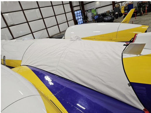
Lear 45 Empennage Saddle Cover W/ Dorsal Inlet Plug (Covers Upper Fuselage Between Pylons, Acm/Apu Area)

WINTER USE MATERIAL - Made with Solution-Dyed Polyester fabric, this option is intended for seasonal use to aid in deicing, rain mitigation, or for occasional travel. The material is lighter and more compact, but more susceptible to UV damage and may have a shorter useful life if used continuously outside than the all-year use material.