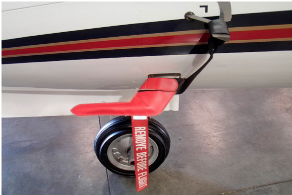
Learjet Heat Resistant Pitot Cover and AOA Strap

The Engine Inlet Plugs are custom fit for your Lear Models 40 & 45 intakes, made with heavy-duty vinyl material, and stuffed with a single block of sculpted urethane foam. Each plug has a zipper that allows the foam to be removed and dried if necessary. Engine plugs have 'remove before flight' streamers sewn onto the face of the plugs. Most plugs are imprinted with the aircraft registration number in black for an extra charge. Storage bag NOT included. Engine plugs may be inserted after flight when the engine is still warm. Engine Inlet Plugs are commonly referred to as Cowl Plugs, Intake Plugs, Cowl Blocks, Engine Blocks, and Engine Bungs.