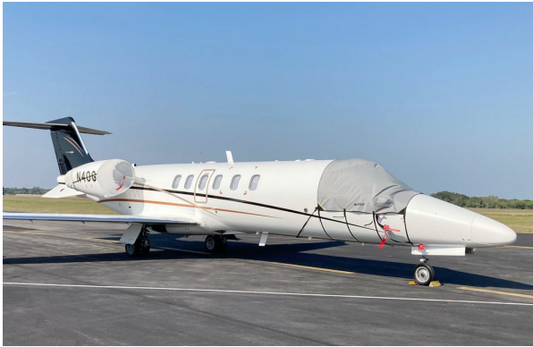
Lear 45 Light Weight Travel Cockpit Cover

This cover type is made from Silver Acrylic Sunbrella canvas and is 100% lined with a soft and smooth microfiber. Bruce's Custom Covers developed this material combination especially for aircraft protection. The outer material is medium weight and treated for water resistance, UV resistance and anti-static buildup. The inner lining is a very soft and smooth microfiber to prevent scratching. The material is very reflective, and tests show that the cabin interior temperature can be reduced to near-ambient temperature on the hottest of days. It is water, ice and snow repellent, yet breathable to allow moisture to escape from between the cover and the aircraft surface.