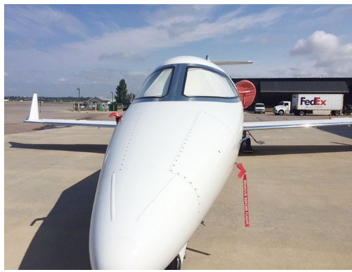
Lear Models 40 & 45 Cockpit Heatshields, Covers All Cockpit Windows