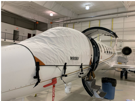
Lear 70 Cockpit Cover