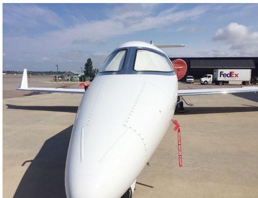
Lear Models 40 & 45 Cockpit Heatshields, Covers All Cockpit Windows