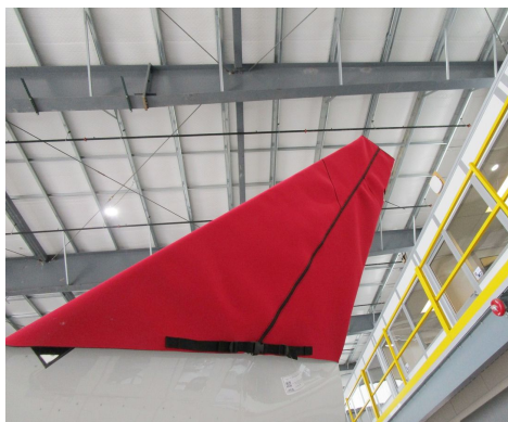
Bombardier Global Express Padded Winglet Covers