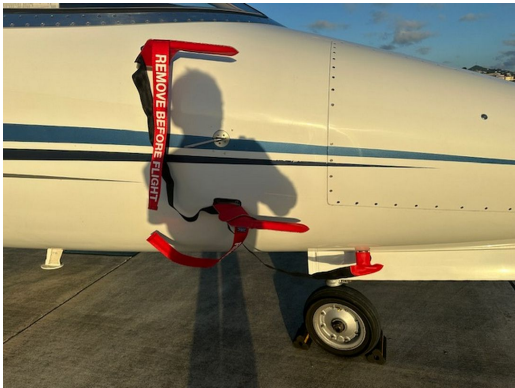
Lear 45 Pitot Cover Set