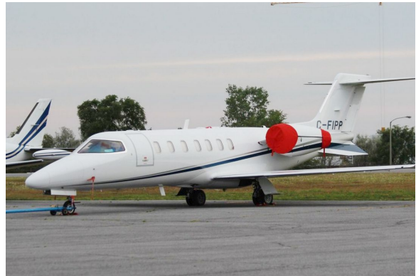
Lear 45 Engine Covers