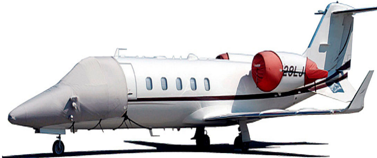
Lear 45 Windshield/Nose & Engine Cover Set

This cover type is made from Silver Acrylic Sunbrella canvas and is 100% lined with a soft and smooth microfiber. Bruce's Custom Covers developed this material combination especially for aircraft protection. The outer material is medium weight and treated for water resistance, UV resistance and anti-static buildup. The inner lining is a very soft and smooth microfiber to prevent scratching. The material is very reflective, and tests show that the cabin interior temperature can be reduced to near-ambient temperature on the hottest of days. It is water, ice and snow repellent, yet breathable to allow moisture to escape from between the cover and the aircraft surface.