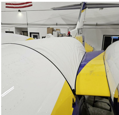
Lear 45 Empennage Saddle Cover W/ Dorsal Inlet Plug (Covers Upper Fuselage Between Pylons, Acm/Apu Area)

WINTER USE MATERIAL - Made with Solution-Dyed Polyester fabric, this option is intended for seasonal use to aid in deicing, rain mitigation, or for occasional travel. The material is lighter and more compact, but more susceptible to UV damage and may have a shorter useful life if used continuously outside than the all-year use material.