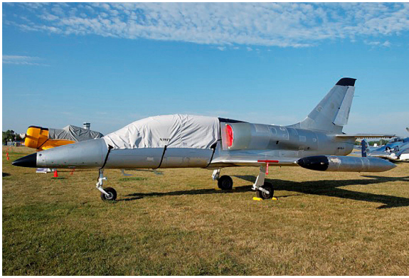
Aero L39 Canopy Cover