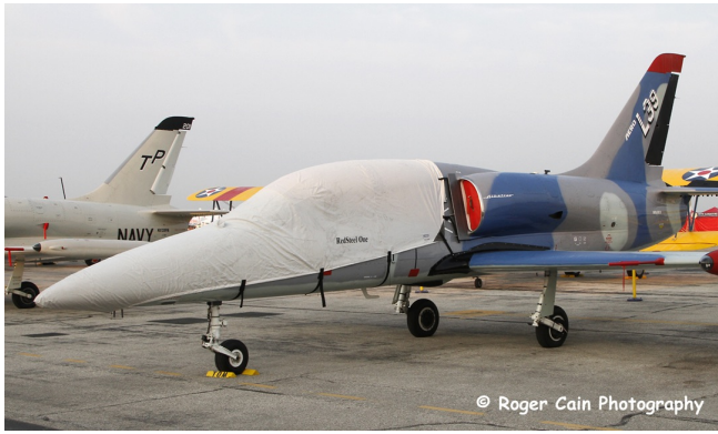
Aero L-39 Canopy/Nose Cover, Engine Plugs