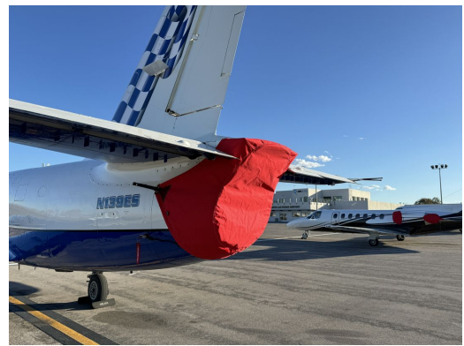
Aero L-39 & L-59 Albatros Exhaust Cover