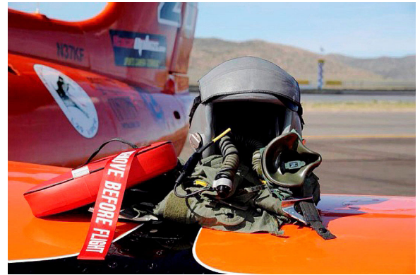
Aero L39 Engine Inlet Plug