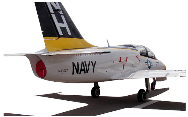
L-39 Exhaust Plug