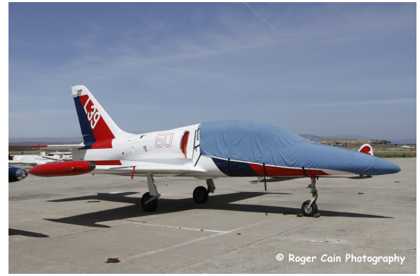
L-39 Canopy/Nose Cover & Plugs