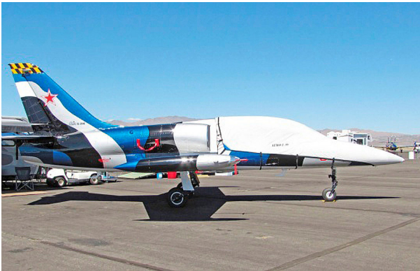
L-39 Canopy/Nose Cover & Plugs