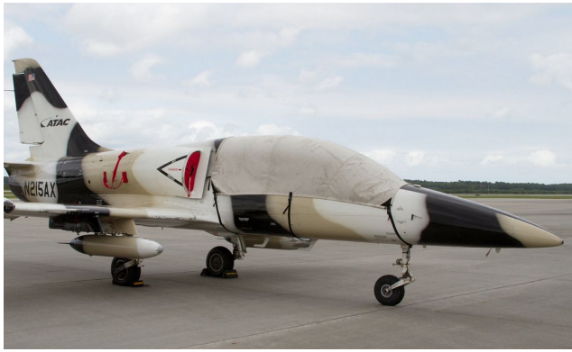
Aero L-39 Canopy Cover, Engine Inlet Plugs