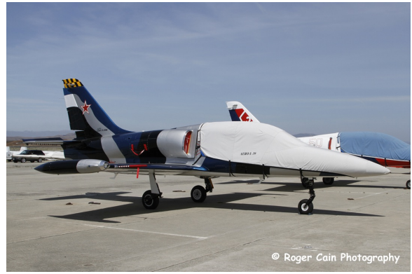
L-39 Canopy/Nose Cover & Plugs