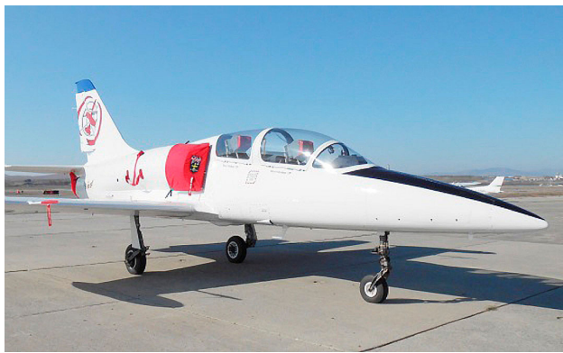
Aero L-39 Engine Covers, Snap-On Type