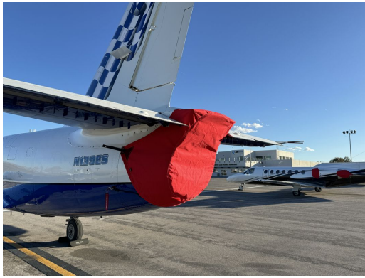
Aero L-39 & L-59 Albatros Exhaust Cover