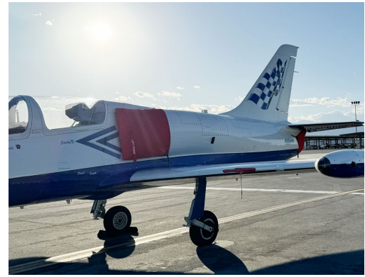
Aero L-39 & L-59 Albatros Intake Covers