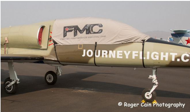
Aero L-39 Canopy Cover, Intake Plugs

This cover type is made from Silver Acrylic Sunbrella canvas and is 100% lined with a soft and smooth microfiber. Bruce's Custom Covers developed this material combination especially for aircraft protection. The outer material is medium weight and treated for water resistance, UV resistance and anti-static buildup. The inner lining is a very soft and smooth microfiber to prevent scratching. The material is very reflective, and tests show that the cabin interior temperature can be reduced to near-ambient temperature on the hottest of days. It is water, ice and snow repellent, yet breathable to allow moisture to escape from between the cover and the aircraft surface.