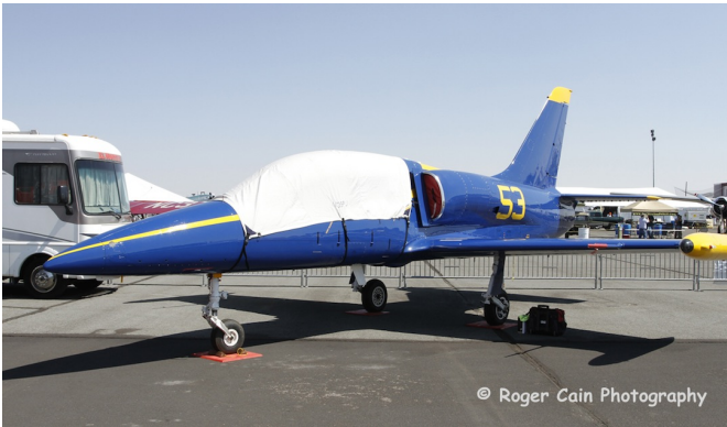
Aero L-39 Canopy Cover, Engine Plugs