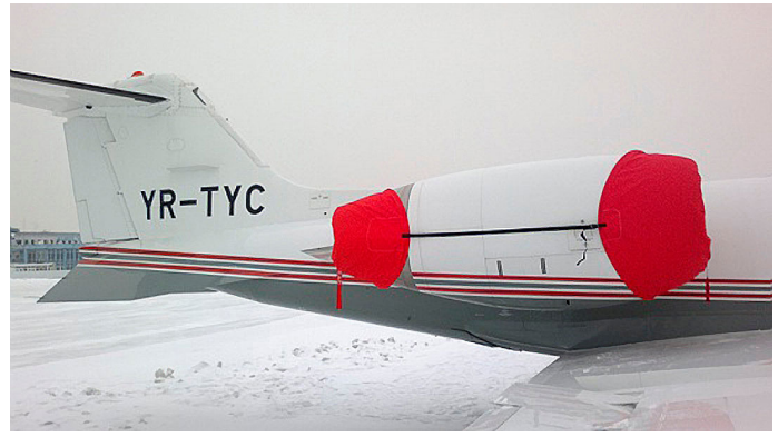
Lear 31 Engine Covers