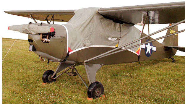
L3 Canopy Cover & Prop Cover

This cover type is made from Silver Acrylic Sunbrella canvas and is 100% lined with a soft and smooth microfiber. Bruce's Custom Covers developed this material combination especially for aircraft protection. The outer material is medium weight and treated for water resistance, UV resistance and anti-static buildup. The inner lining is a very soft and smooth microfiber to prevent scratching. The material is very reflective, and tests show that the cabin interior temperature can be reduced to near-ambient temperature on the hottest of days. It is water, ice and snow repellent, yet breathable to allow moisture to escape from between the cover and the aircraft surface.