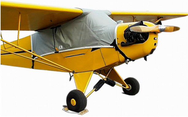
Piper J3 Canopy Cover