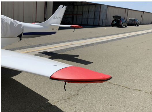
Lancair Legacy 2000 Wingtip & Horiz. Stab. Pads