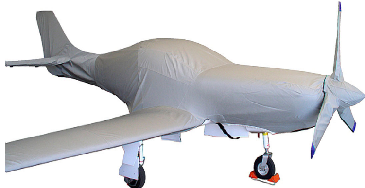
Lancair 320 Complete Fuselage/Wing Cover & Prop Cover