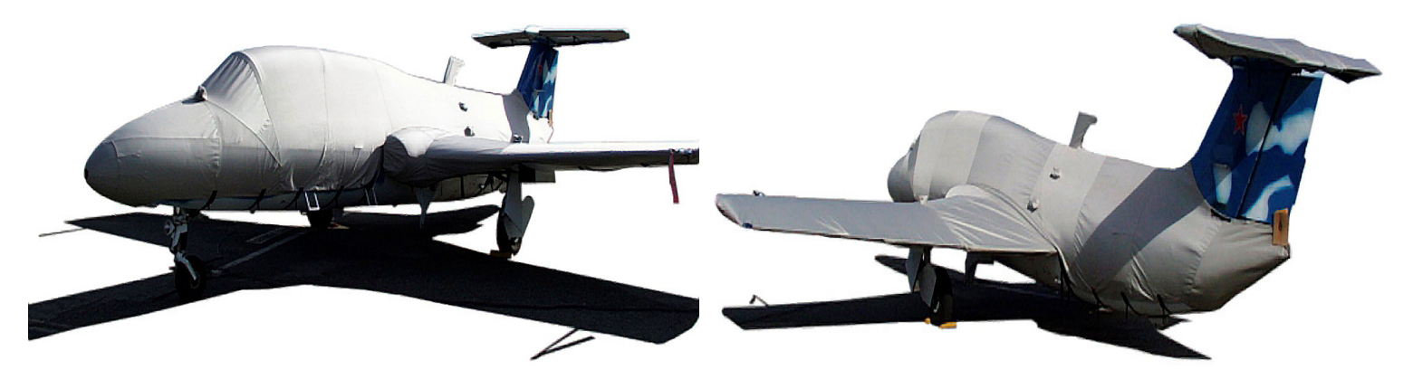
Fuselage, Wings & Horizontal Stabilizer Cover

mitigation, or for occasional travel. The material is lighter and more compact, but more susceptible to UV damage and may have a shorter useful life if used continuously outside than the all-year use material.