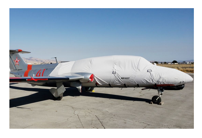
Aero L-29 Extended Canopy/Nose Cover, Engine Plugs