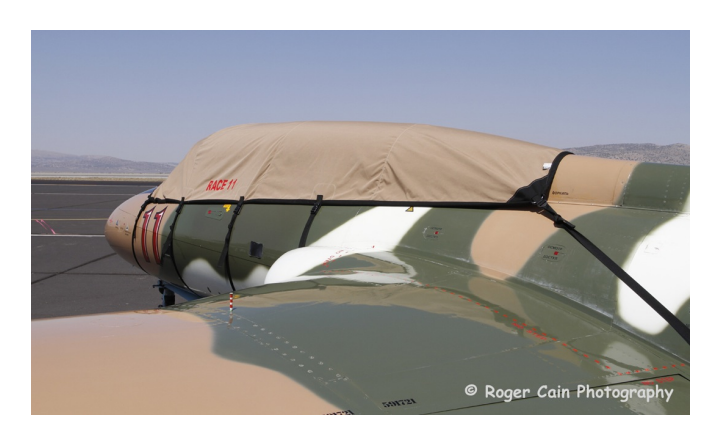
Aero L-29 Canopy Cover