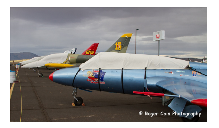
Aero L-29 Canopy Cover, Pitot Cover