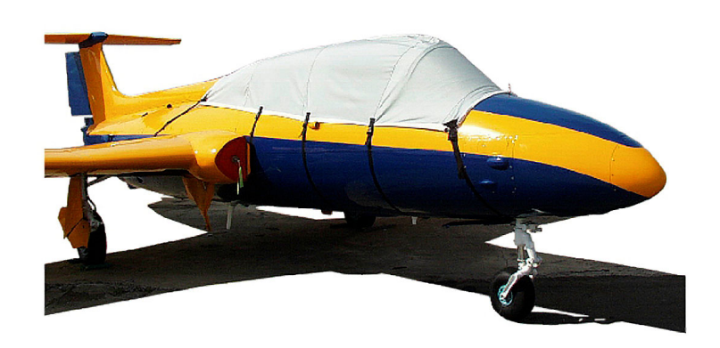
Canopy Cover for the L-29 Delfin Maya

Travel Covers are made with Silver Solution-Dyed Polyester fabric and only lined over the windshield to save weight. The material is lightweight and more compact for easy stowage in the aircraft. The polyester material is water resistant, but only intended for occasional use outside. We also have an ultra lightweight material available for fitted hangar dust covers. For daily outdoor use, the non-travel Sunbrella Cover is the best choice.