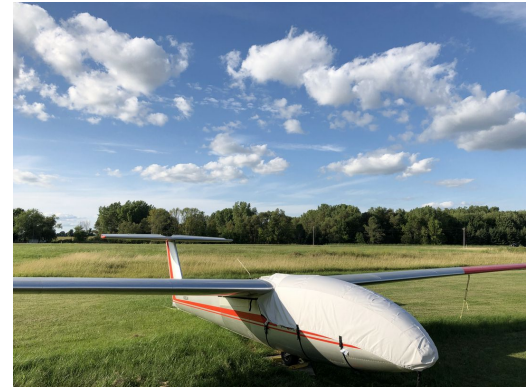
L-23 Super Blanik Canopy/Nose Cover